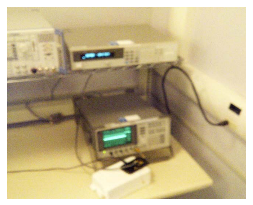
Test Setup Photos