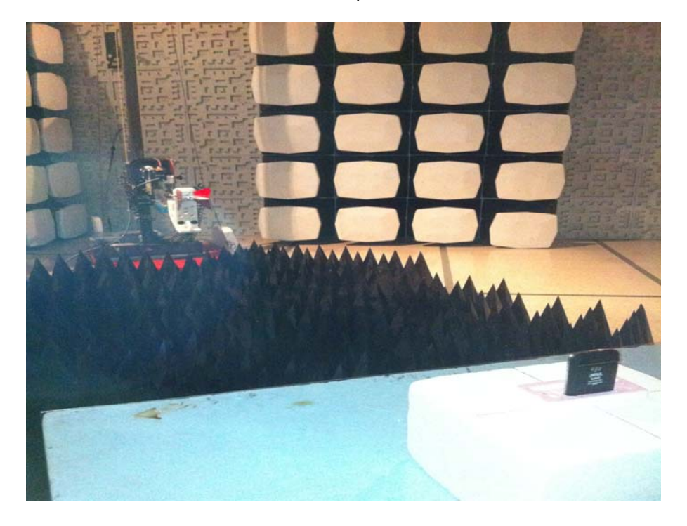
Radiated Emissions Test-Setup Photos cont'd