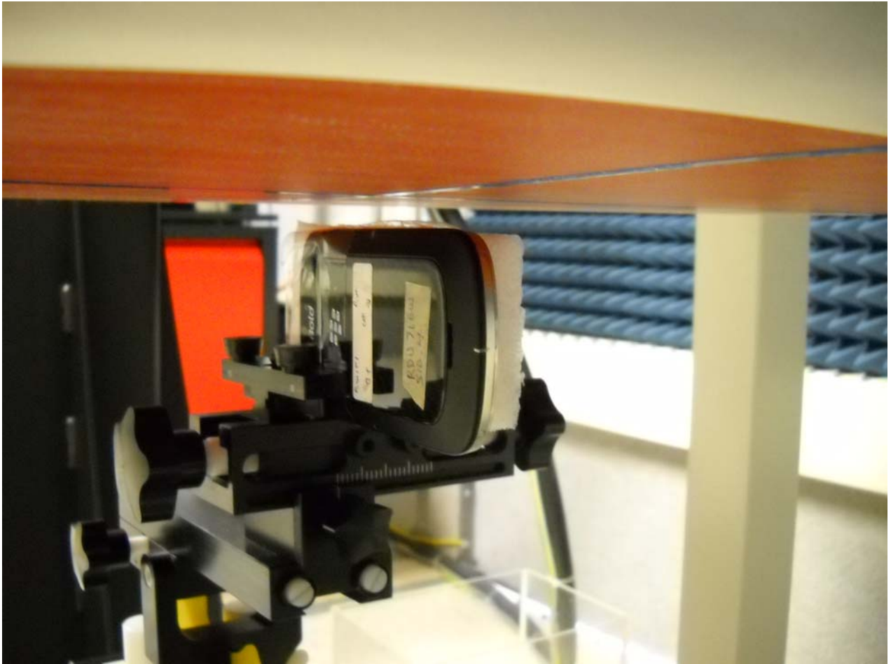
Photo 3. Left Edge 10mm