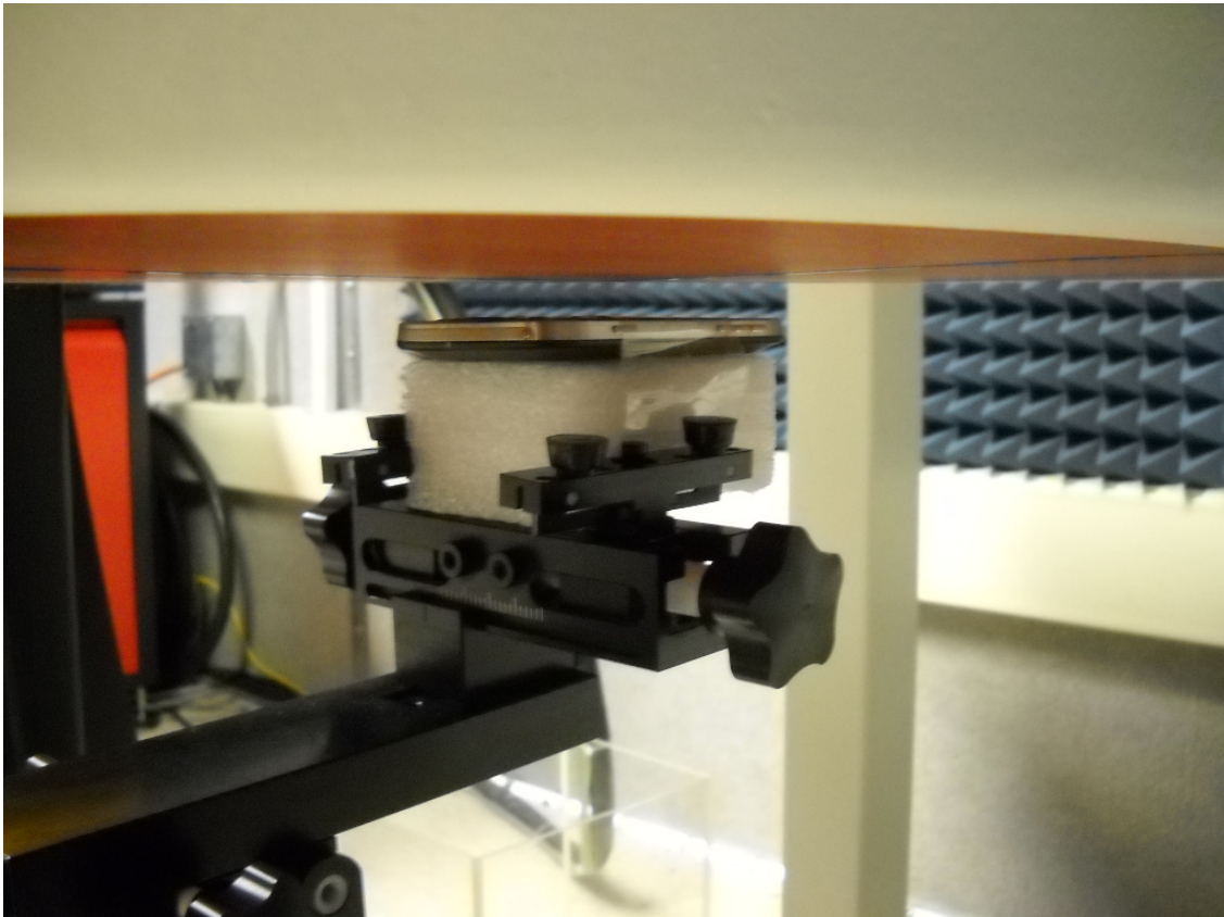
Photo 1. Front 10mm