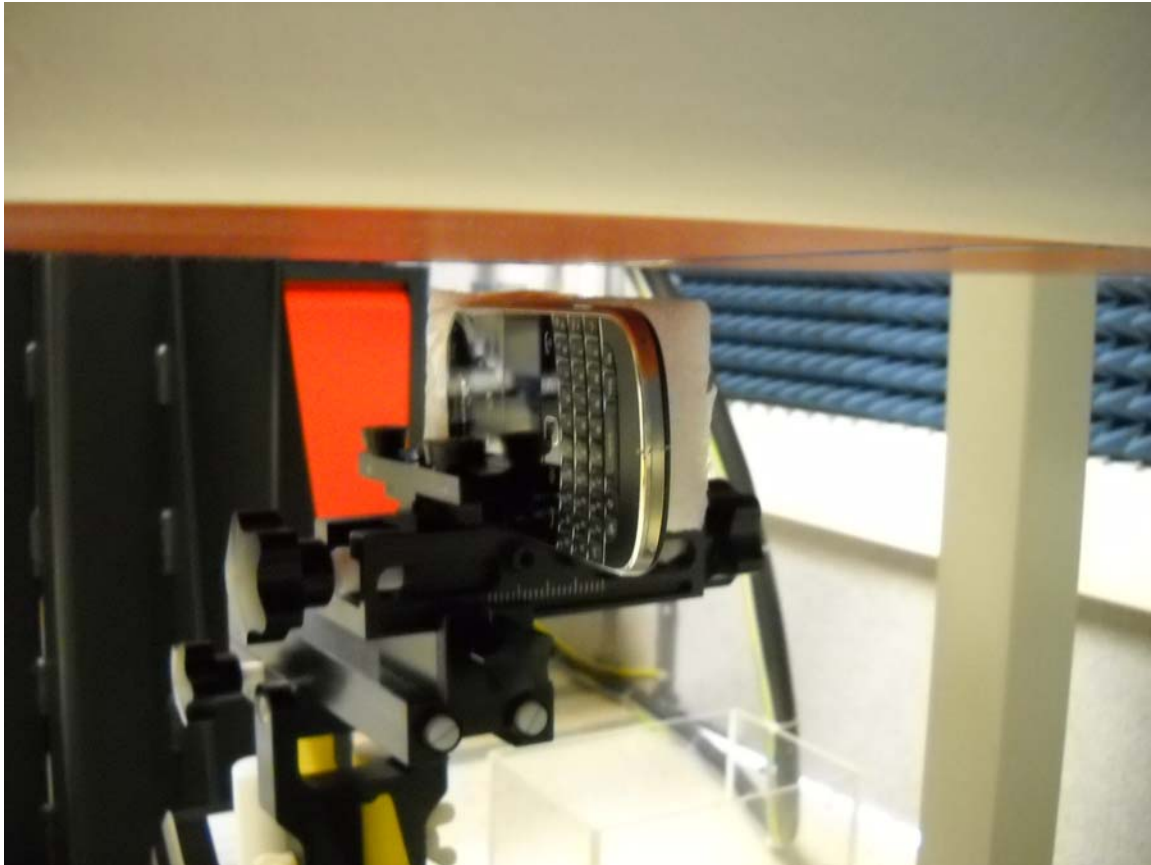
Photo 4. Right Edge 10mm