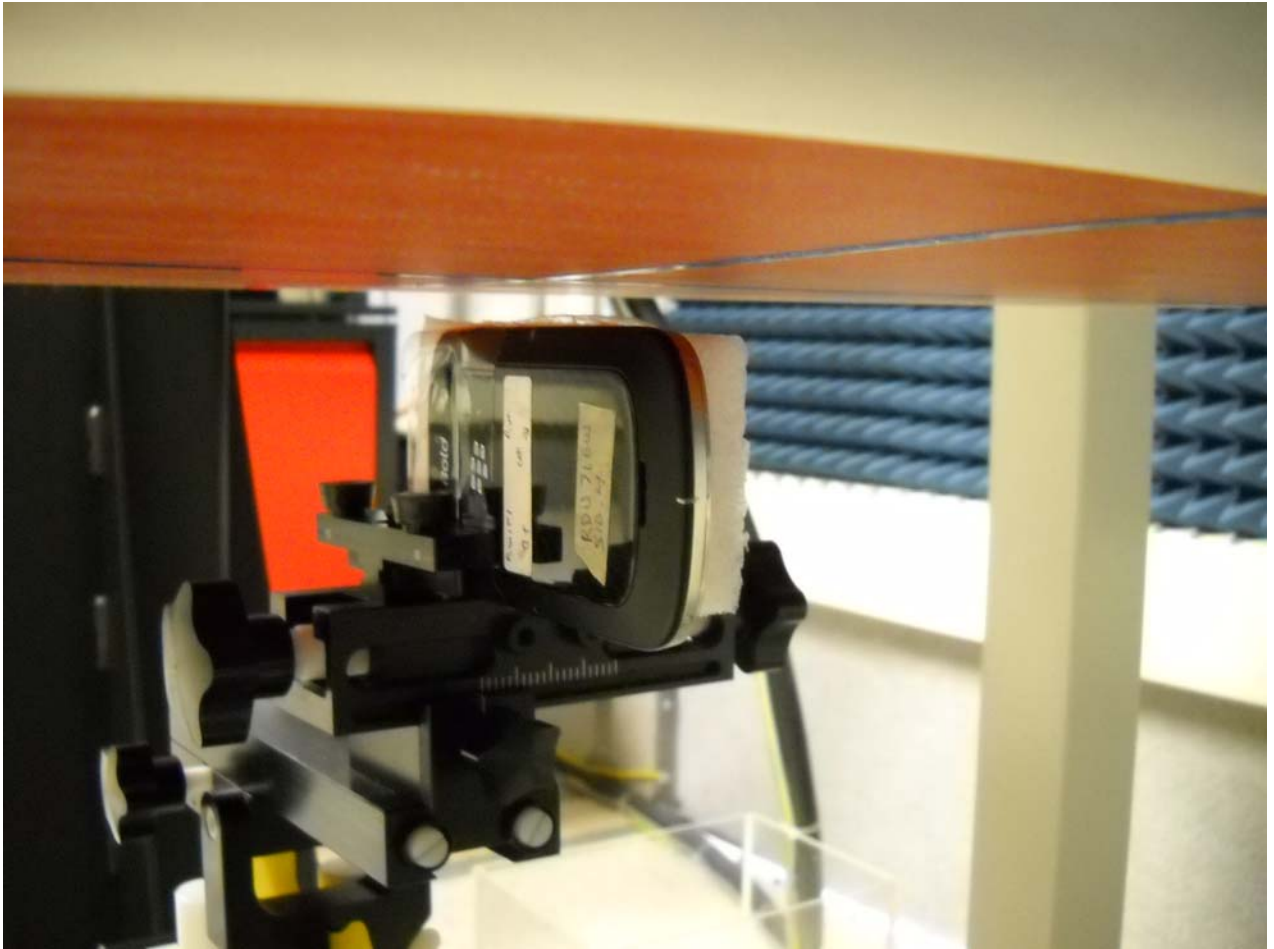
Photo 3. Left Edge 10mm