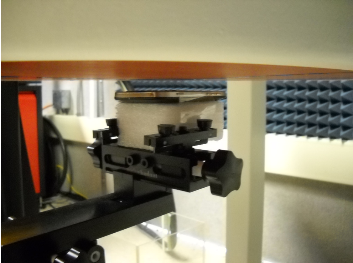
Photo 1. Front 10mm