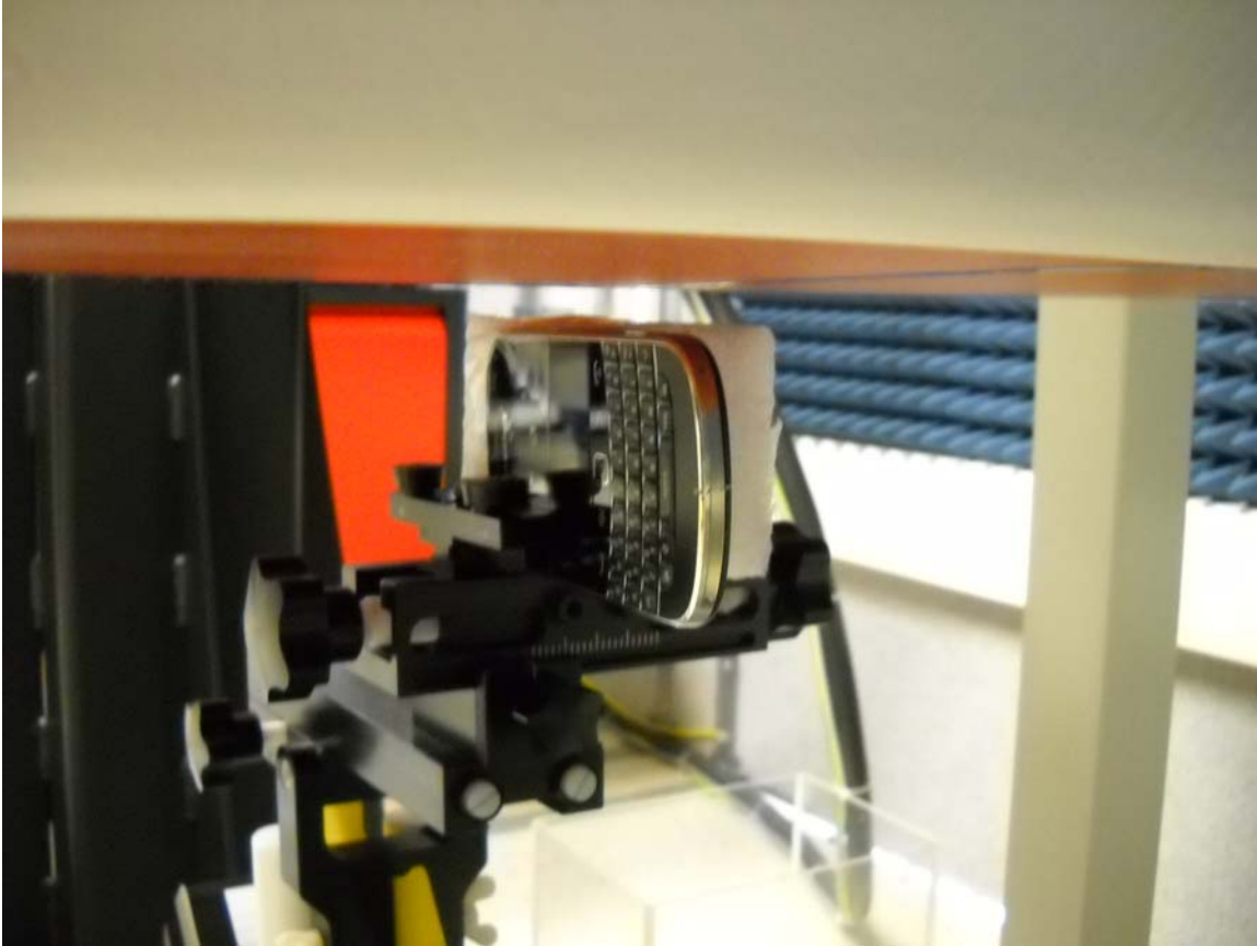
Photo 4. Right Edge 10mm