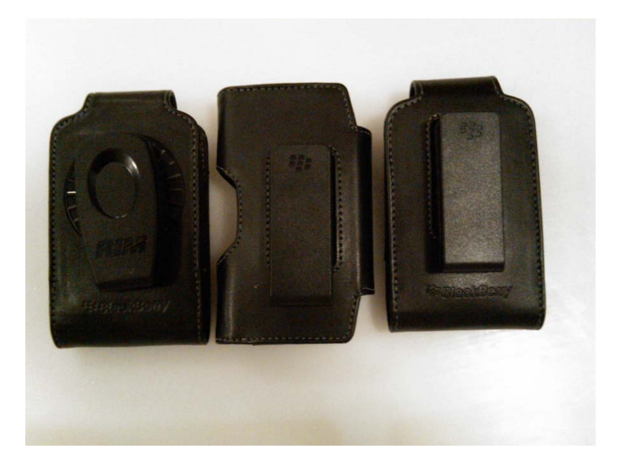
Figure E3. Body worn holsters – back