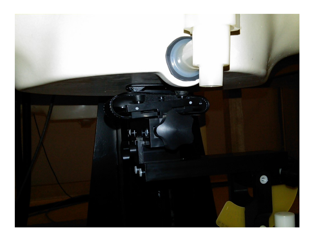
Figure E6. Body-worn configuration (Vertical Holster #1, back facing phantom)