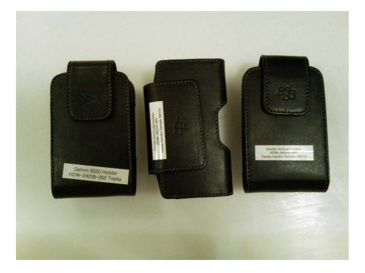
Figure E2. Body worn holsters – front