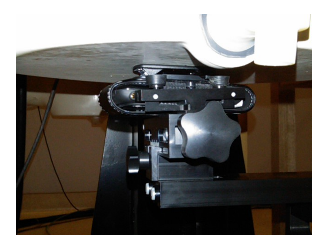
Figure E9. Body-worn configuration (Vertical Holster #1, front facing phantom)