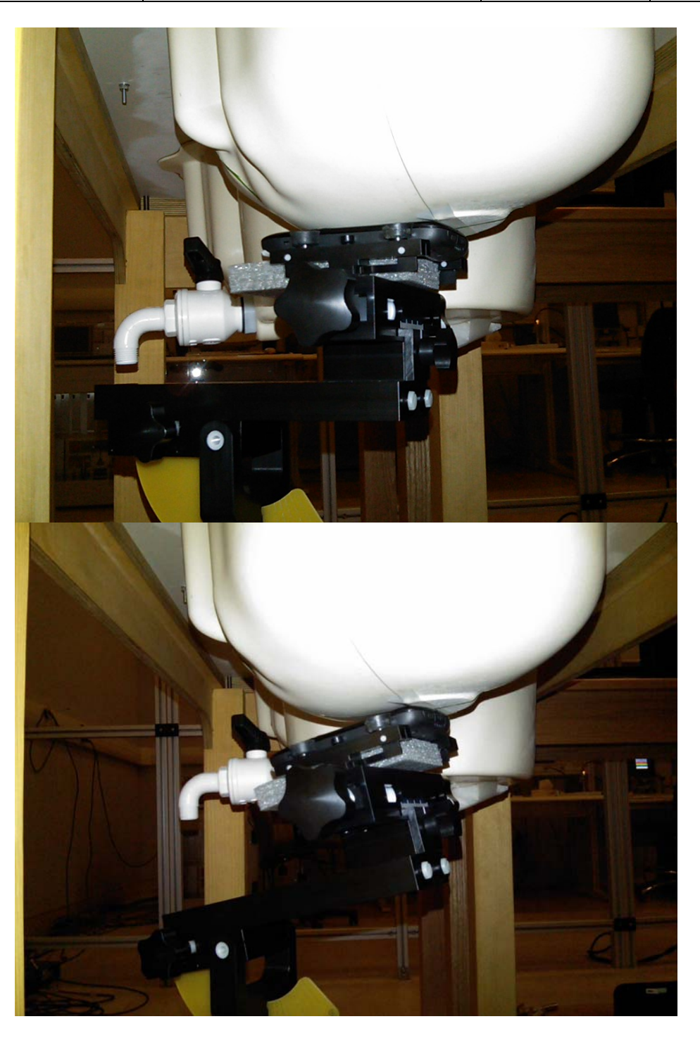
Figure E5. Head configuration (Left Touch/Tilt)