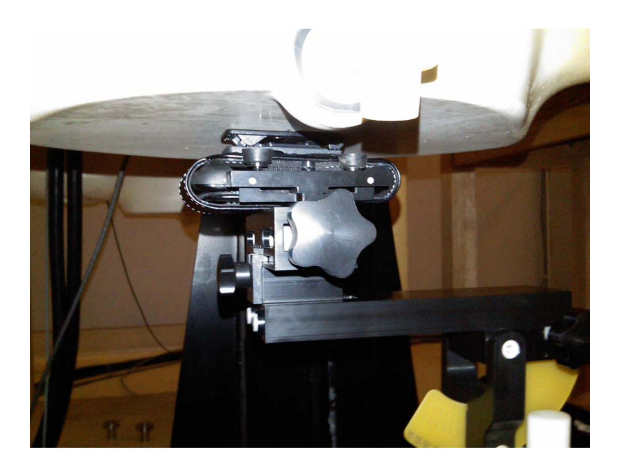
Figure E10. Body-worn configuration (Vertical Holster #2, back facing phantom)