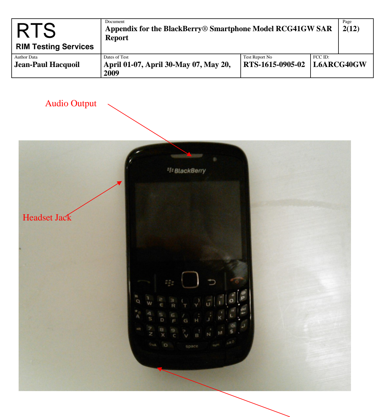
Figure E1. BlackBerry Smartphone