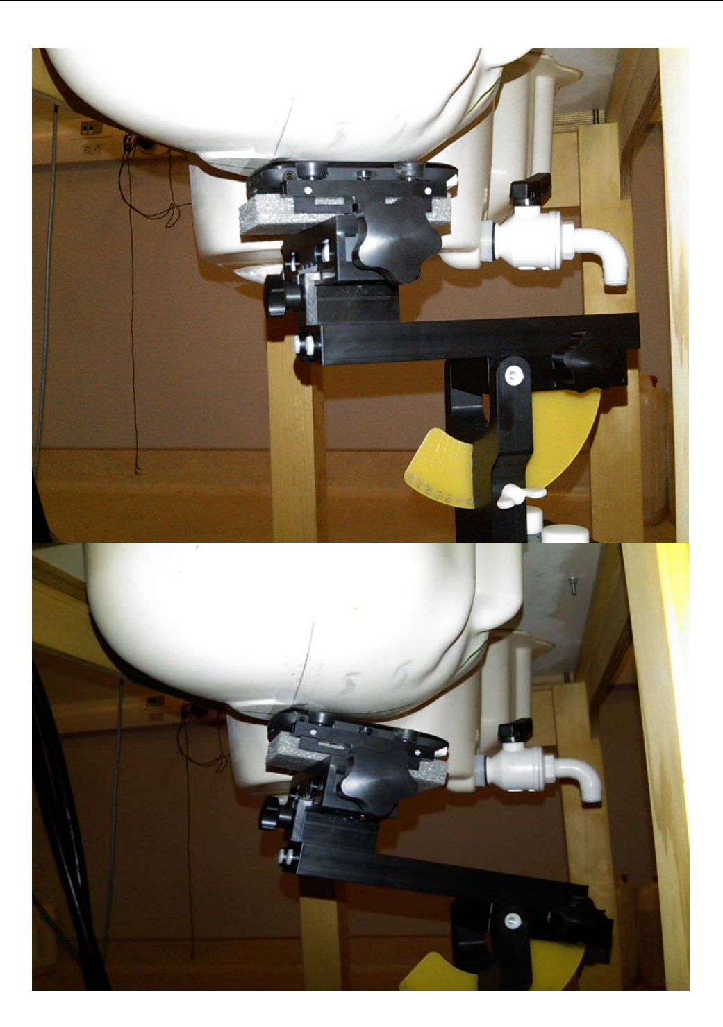
Figure E4. Head configuration (Right Touch/Tilt)