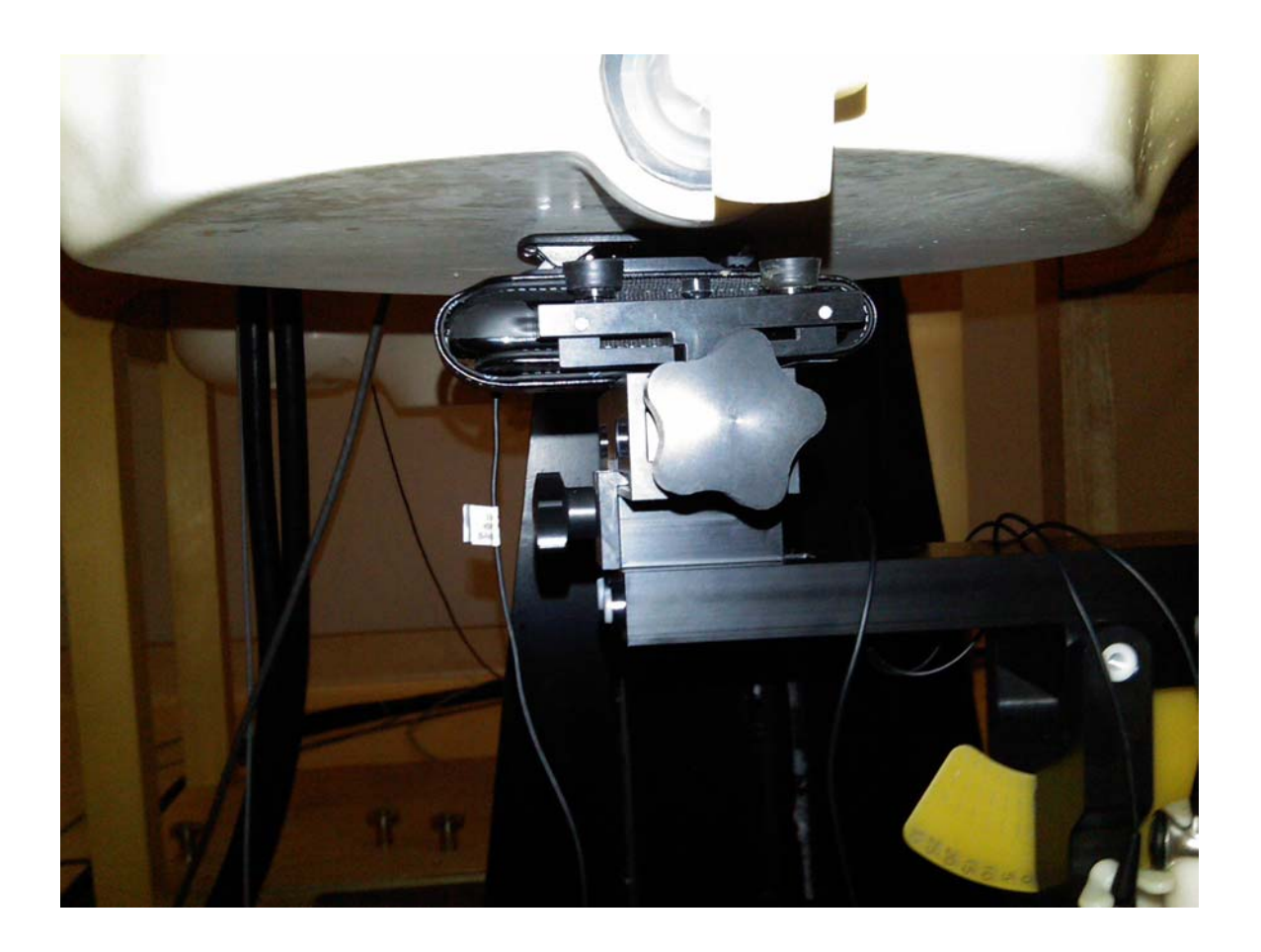
Figure E7. Body-worn configuration (Vertical Holster #1, headset, back facing phantom)