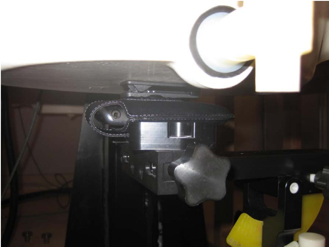
Figure E6. Body-worn configuration (Leather Swivel Holster, back facing phantom)