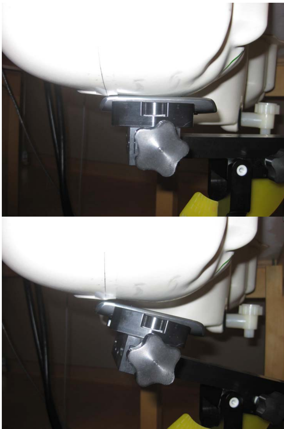
Figure E4. Head configuration (Right Touch/Tilt)