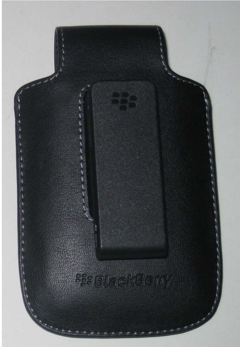
Figure E3. Body worn holster – back