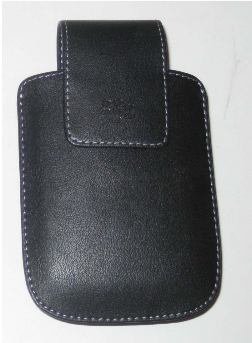
Figure E2. Body worn holster – front