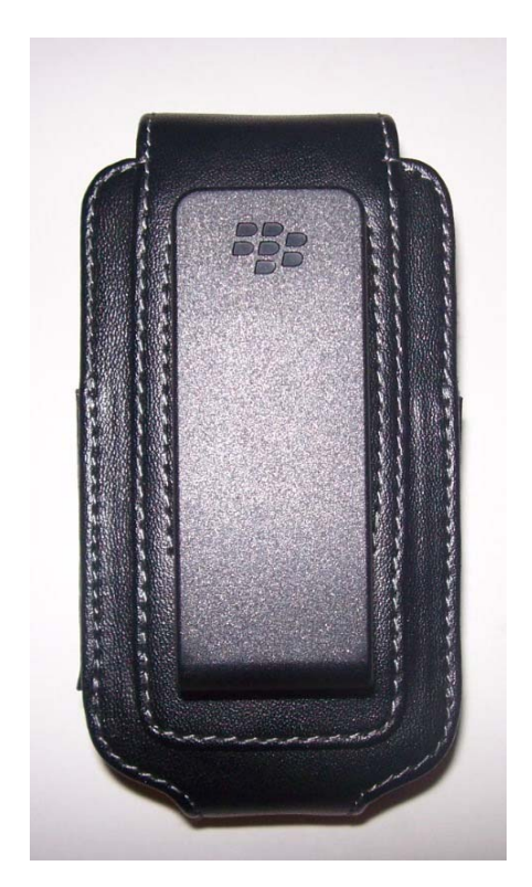
Figure E3. Body worn holster