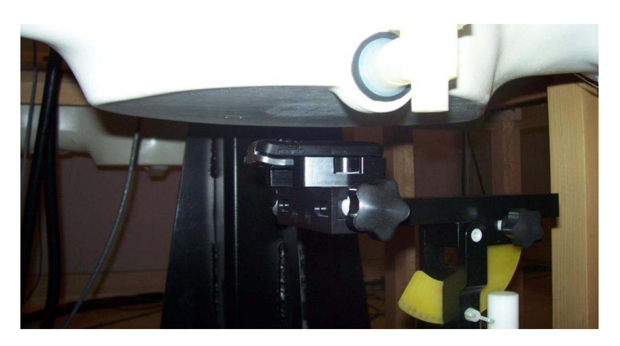
Figure E10. Body-worn configuration (No Holster, 25 mm away, back facing phantom)