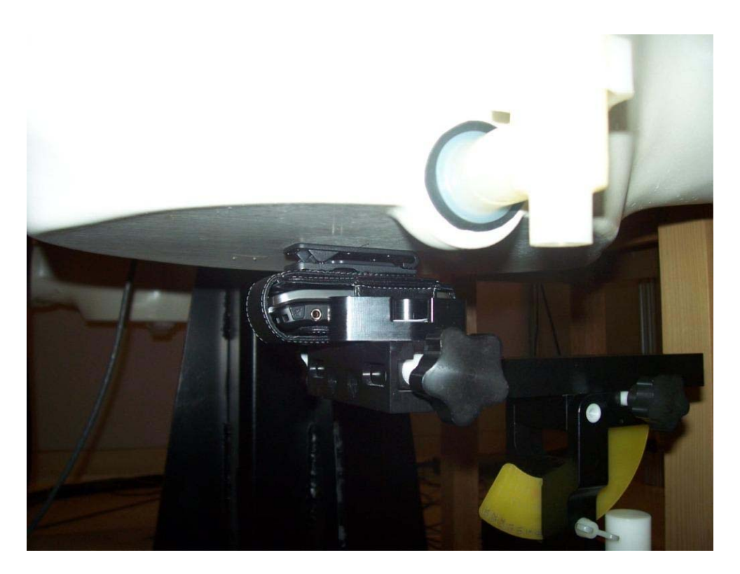
Figure E8. Body-worn configuration (Holster 1, front facing phantom)