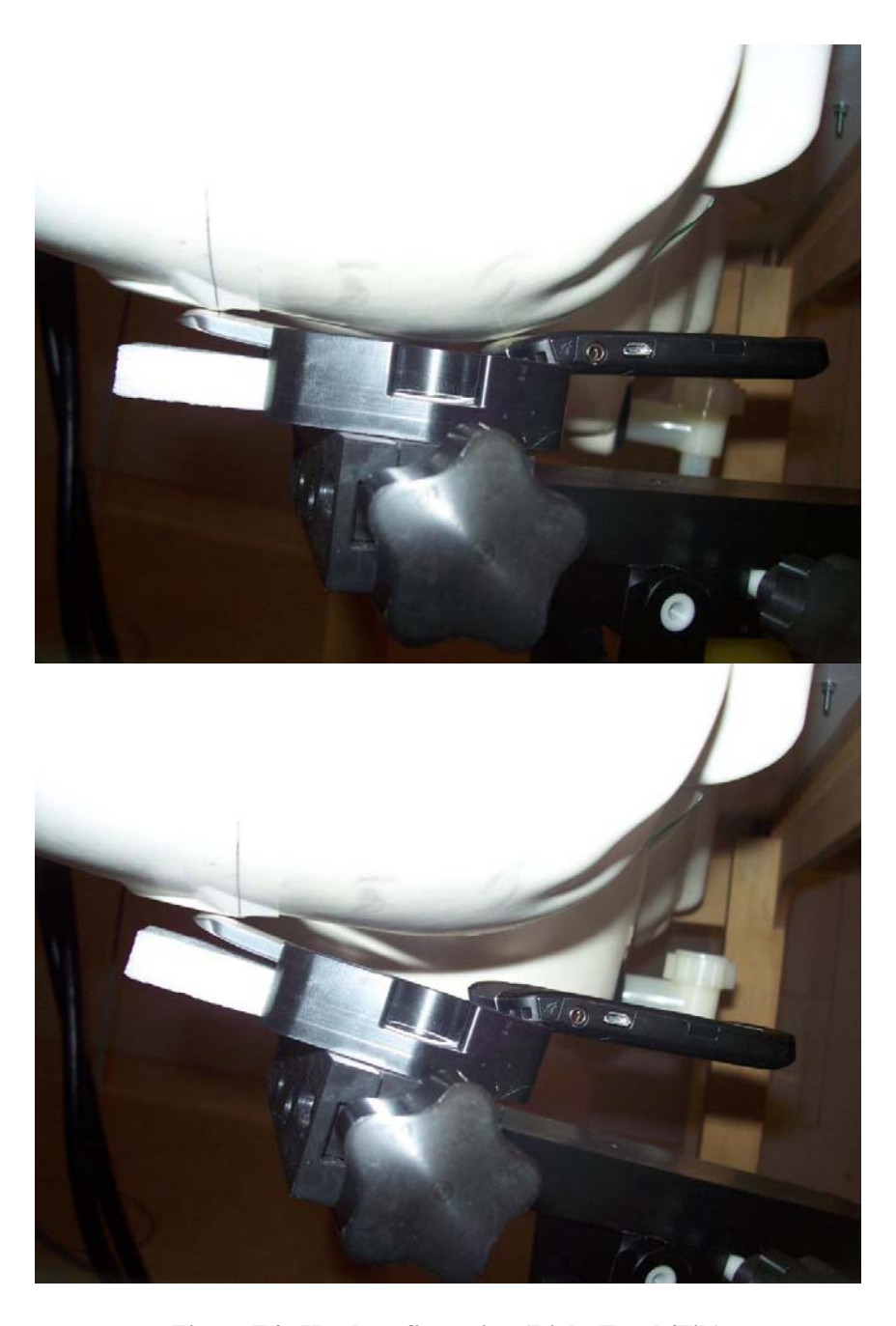
Figure E4. Head configuration (Right Touch/Tilt)