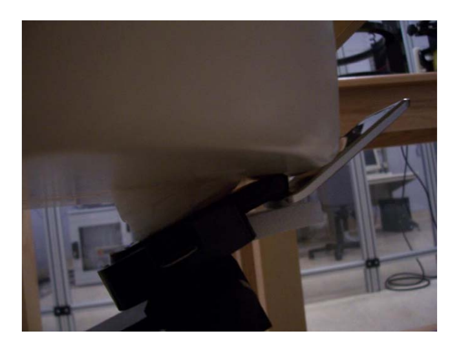
Figure E6. Head configuration (Flat Touch)