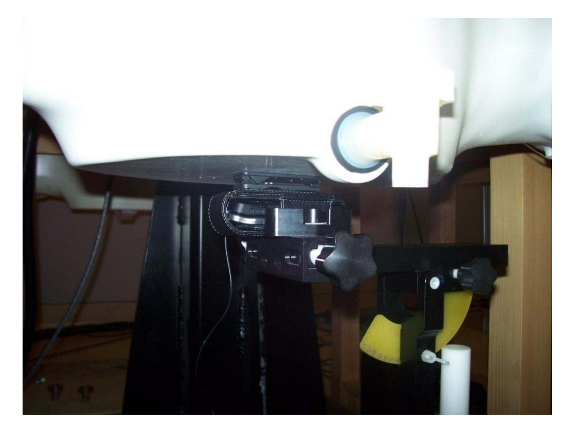
Figure E9. Body-worn configuration (Holster 1, headset, back facing phantom)