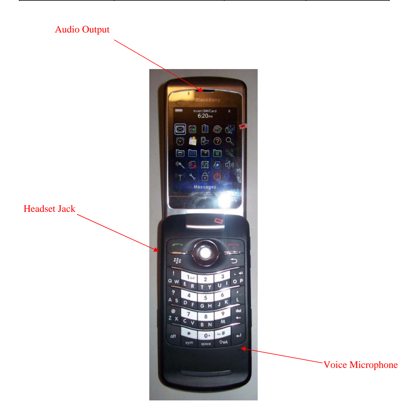
Figure E1. BlackBerry Smartphone - Flip Open