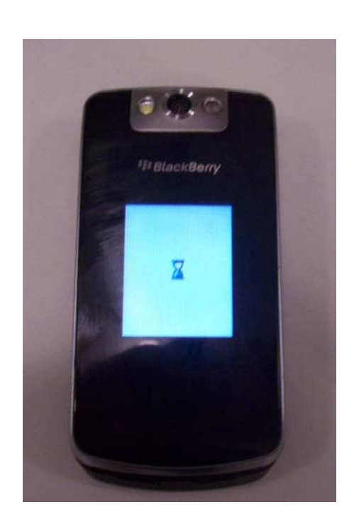
Figure E2. BlackBerry Smartphone – Flip Closed