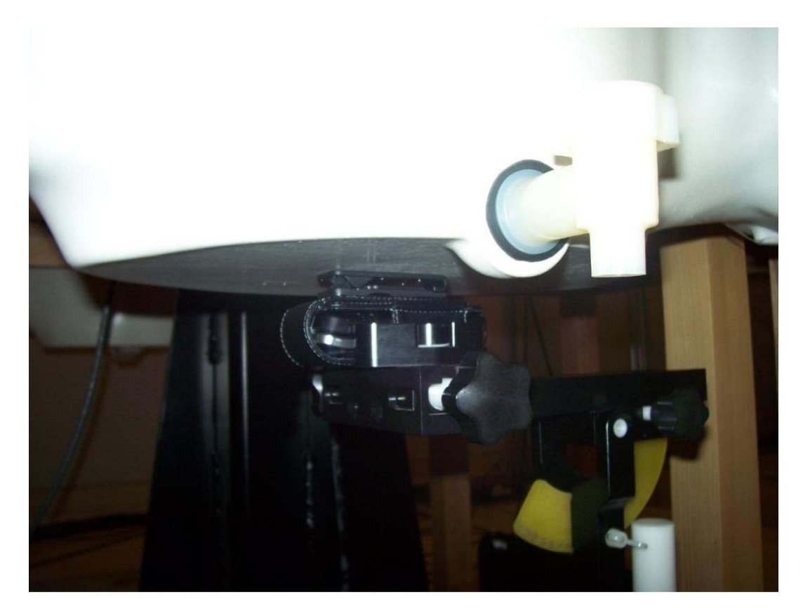
Figure E7. Body-worn configuration (Holster 1, back facing phantom)