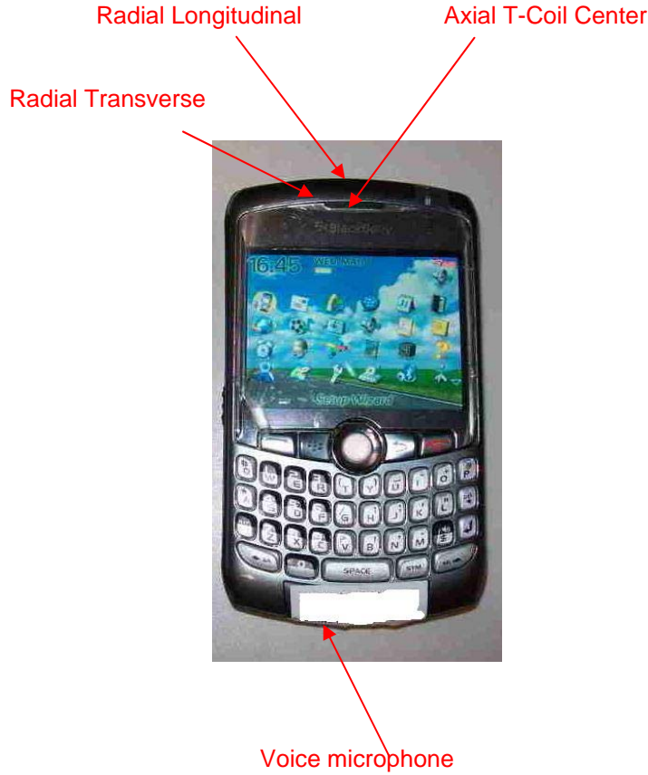
Figure E1: BlackBerry® Smartphone