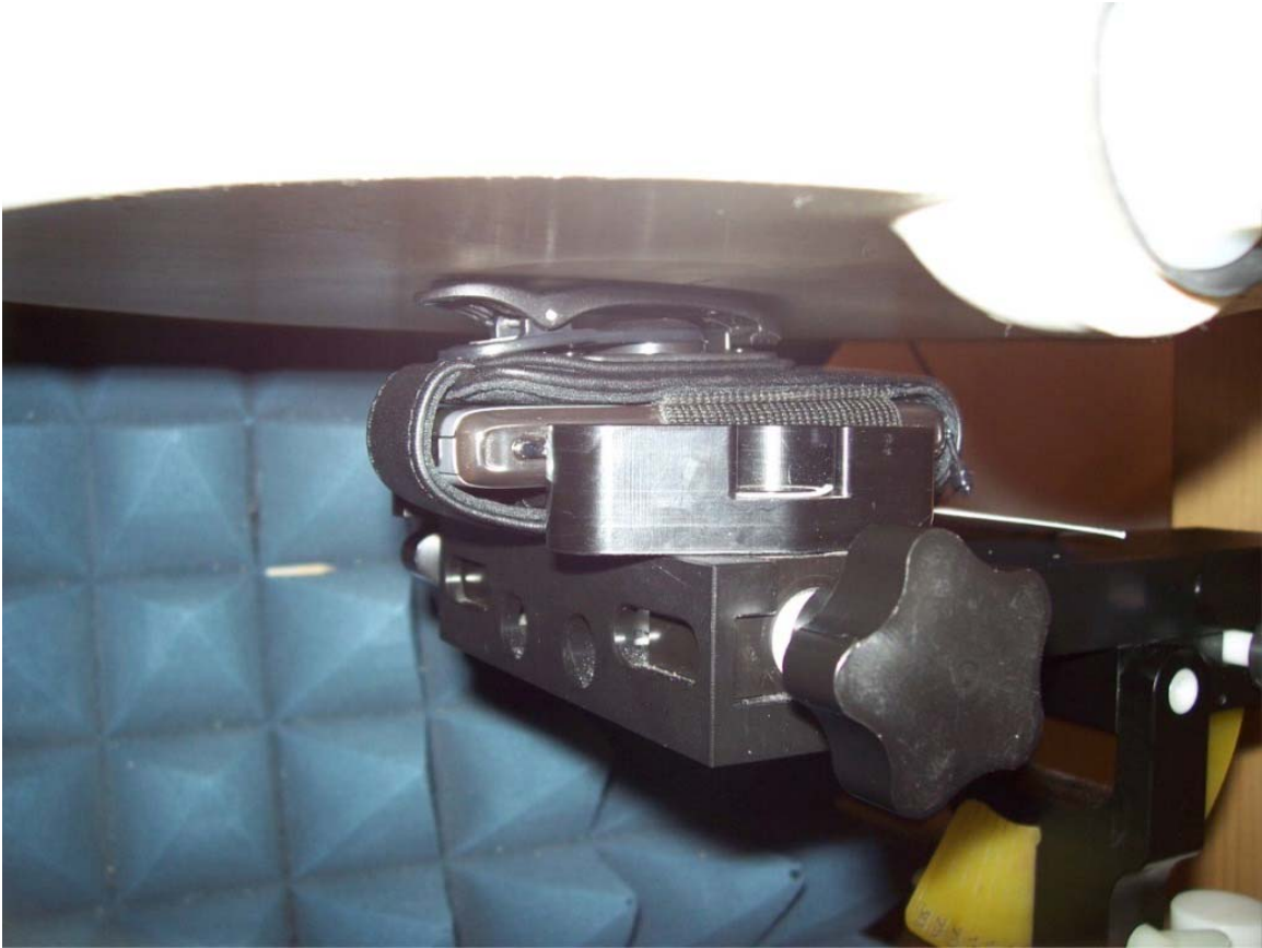
Figure E10. Body-worn configuration (Black Premium Leather Holster, back facing phantom)