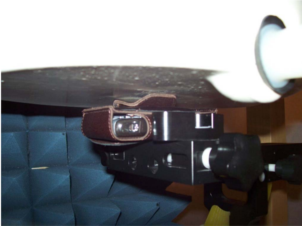
Figure E12. Body-worn configuration (Horizontal Holster, front facing phantom)