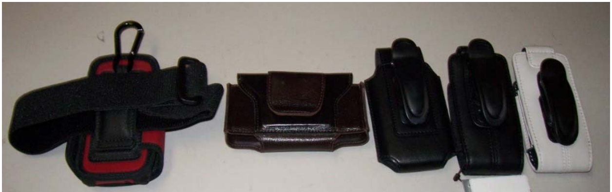
Figure E2. Body worn holsters