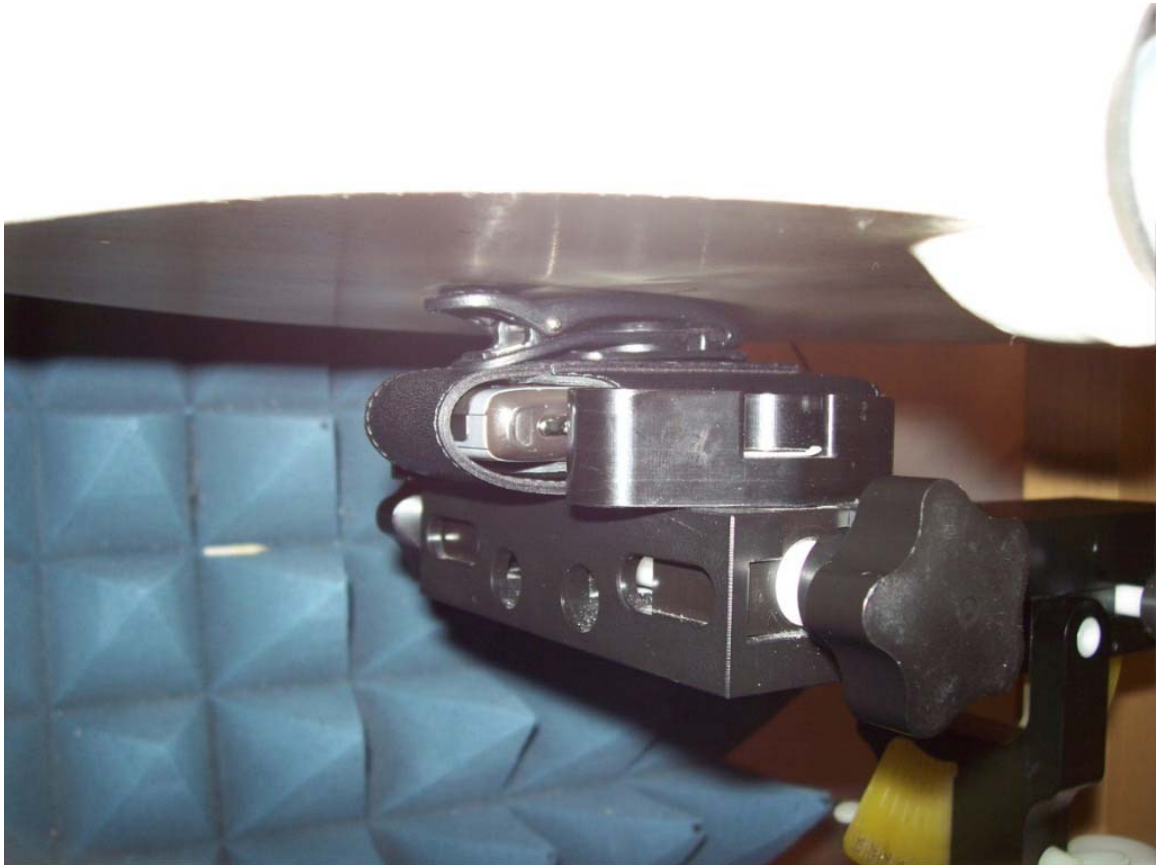
Figure E11. Body-worn configuration (Euro Swivel Holster, back facing phantom)