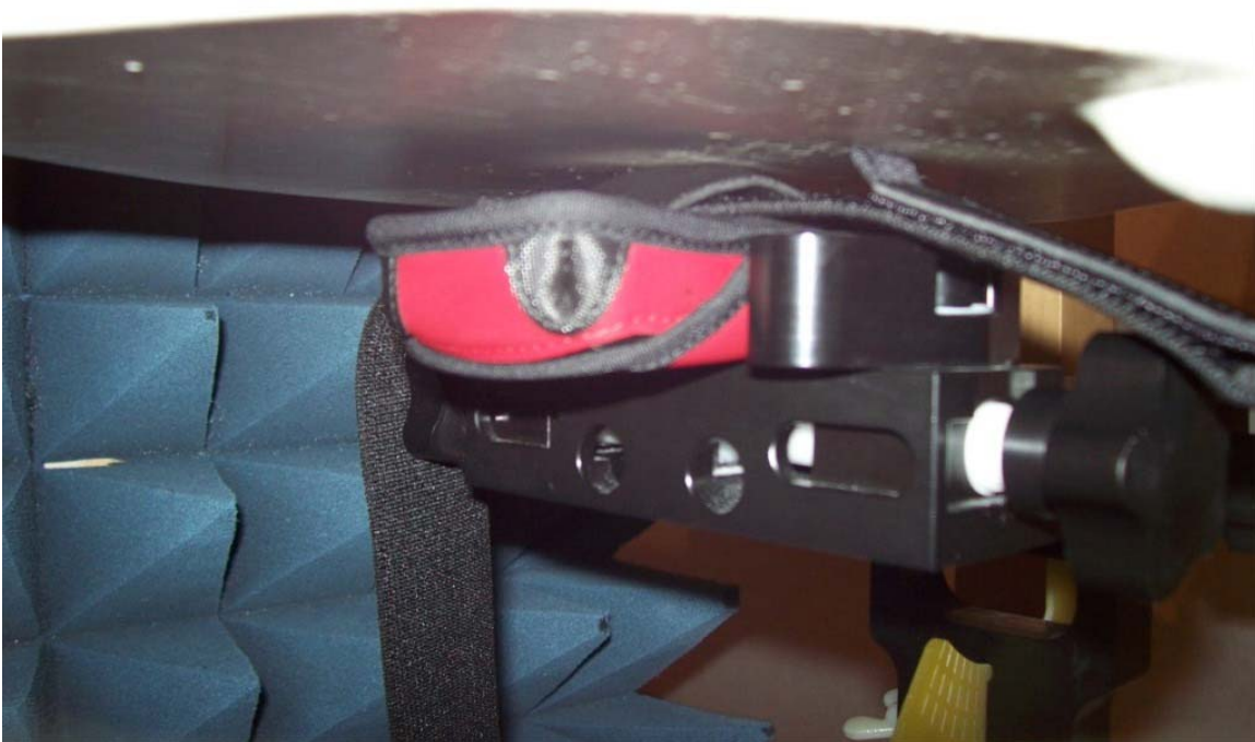
Figure E13. Body-worn configuration (Sportscase with strap, front facing phantom)