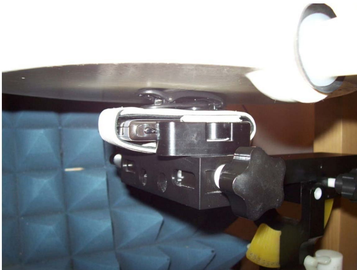
Figure E5. Body-worn configuration (Leather Swivel Holster, back facing phantom)