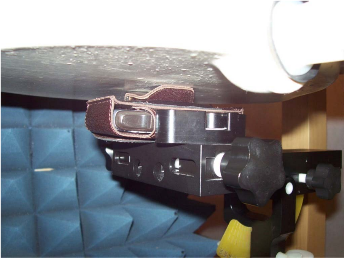
Figure E6. Body-worn configuration (Horizontal Holster, back facing phantom)