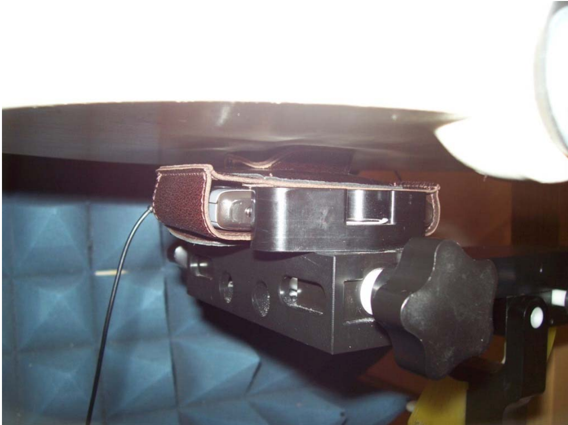
Figure E14. Body-worn configuration (Horizontal Holster, headset, back facing phantom)