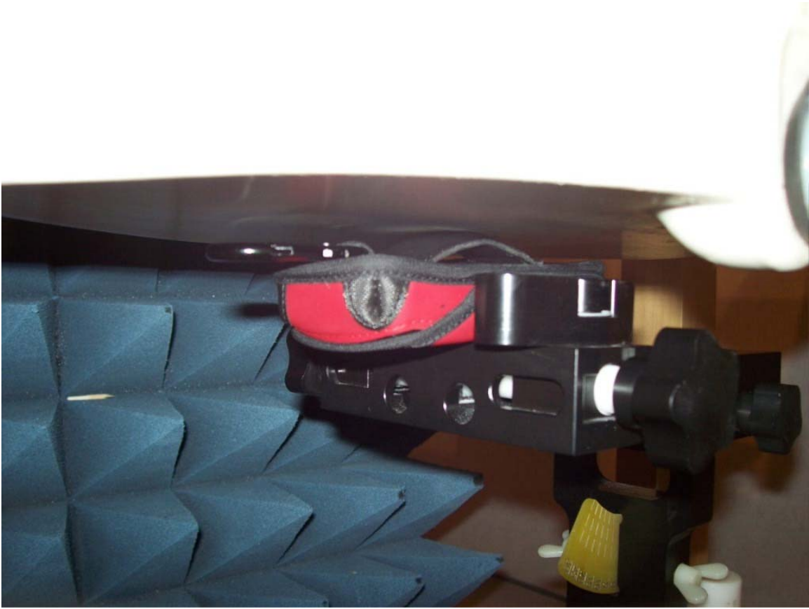
Figure E8. Body-worn configuration (Sports case with clip, back facing phantom)