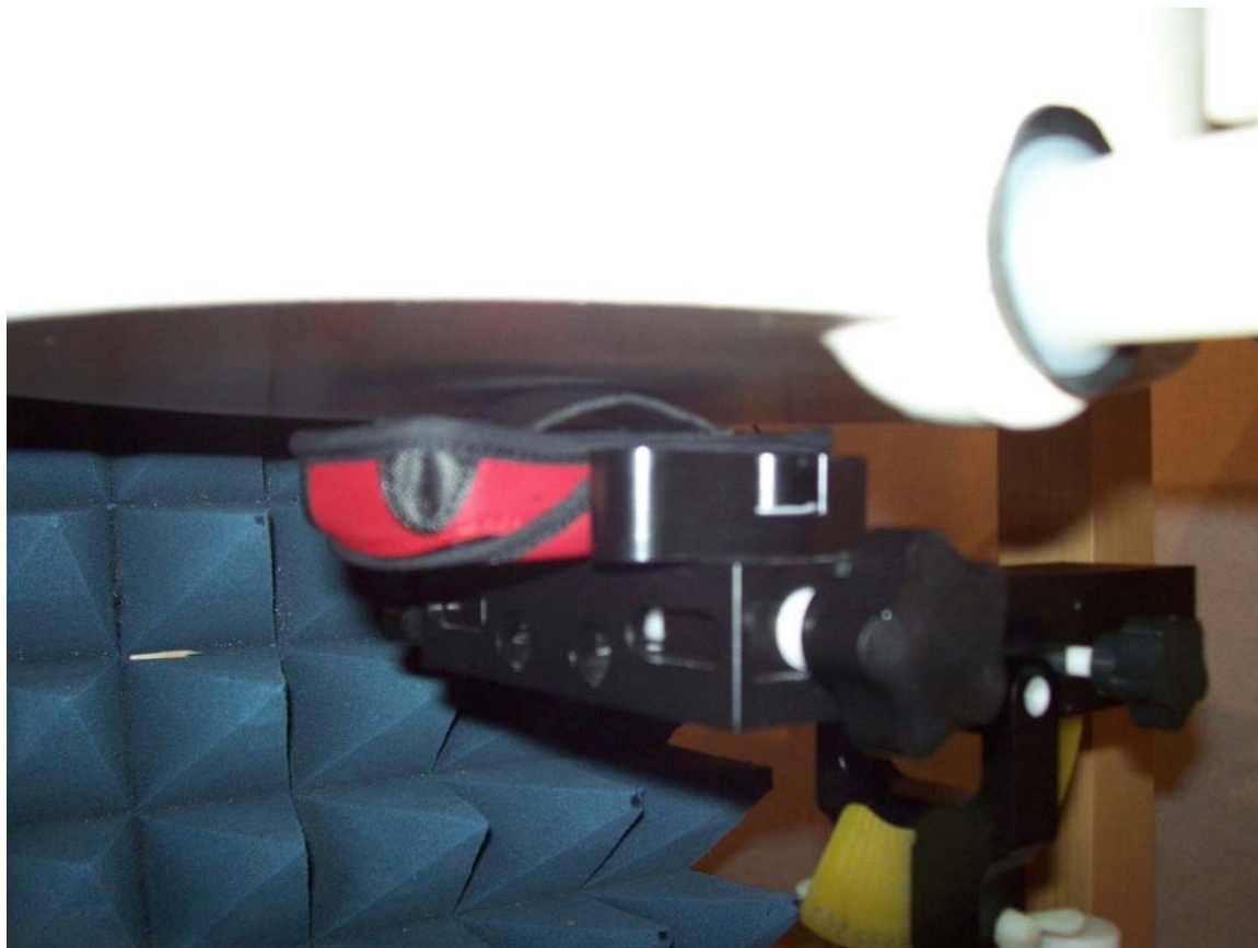
Figure E9. Body-worn configuration (Sports case without clip or strap, back facing phantom)