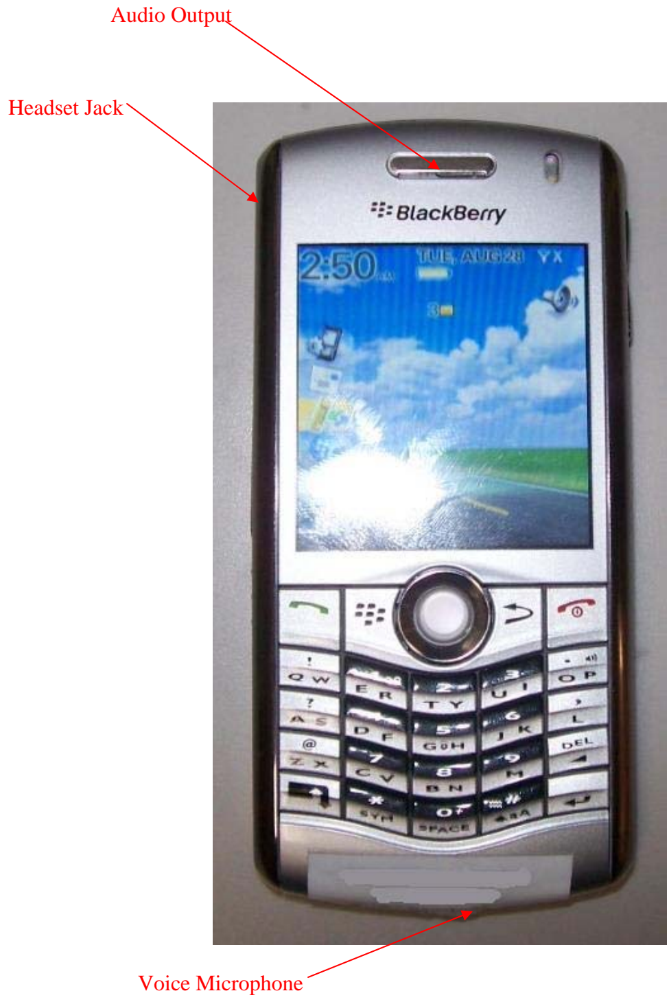
Figure E1. BlackBerry Smartphone