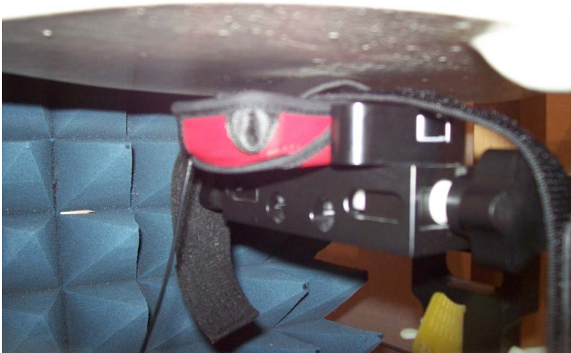
Figure E15 Body-worn configuration (Sportscase with strap, headset, back facing phantom)