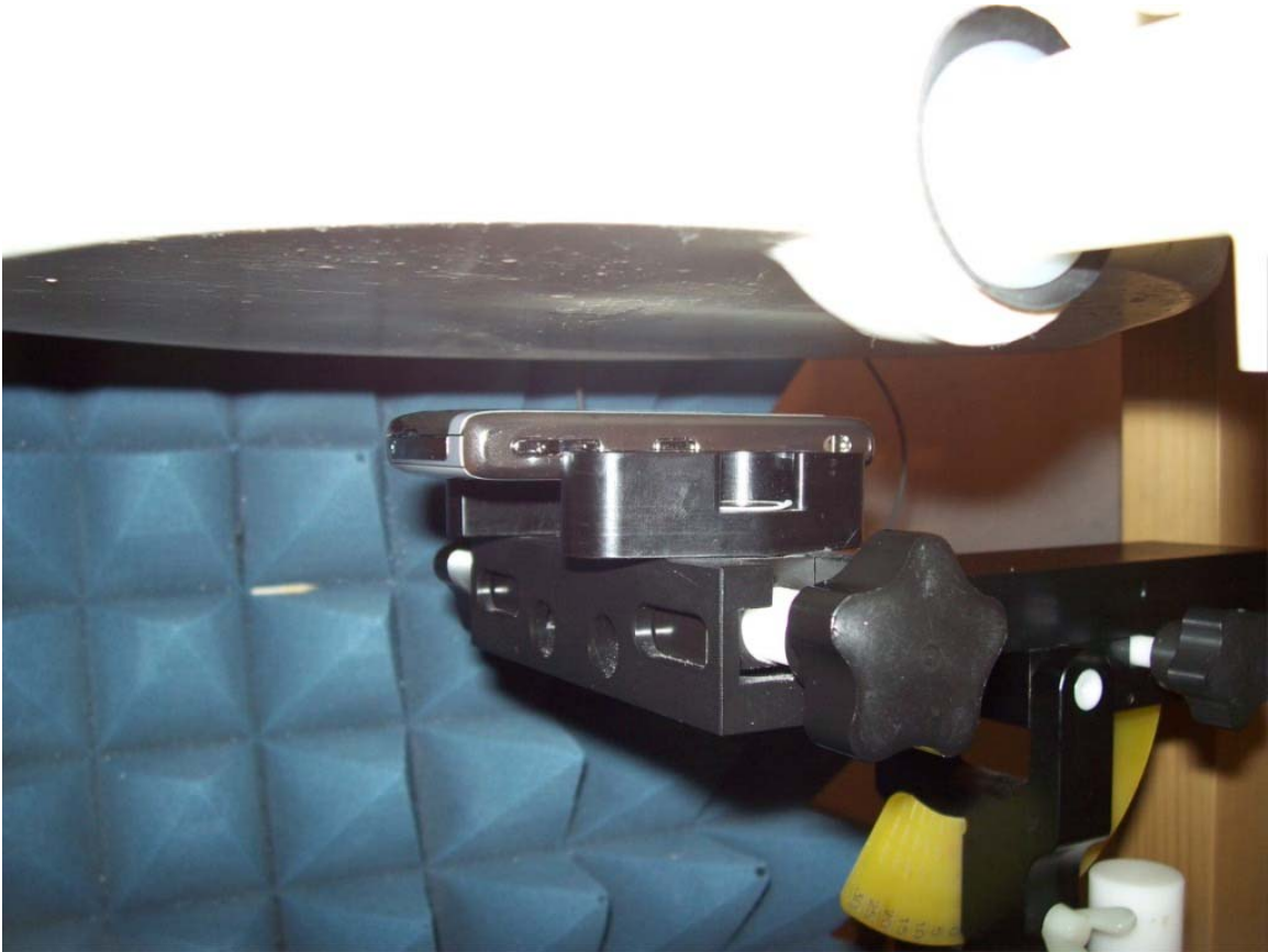
Figure E16. Body-worn configuration (No Holster, 25 mm away, back facing phantom)