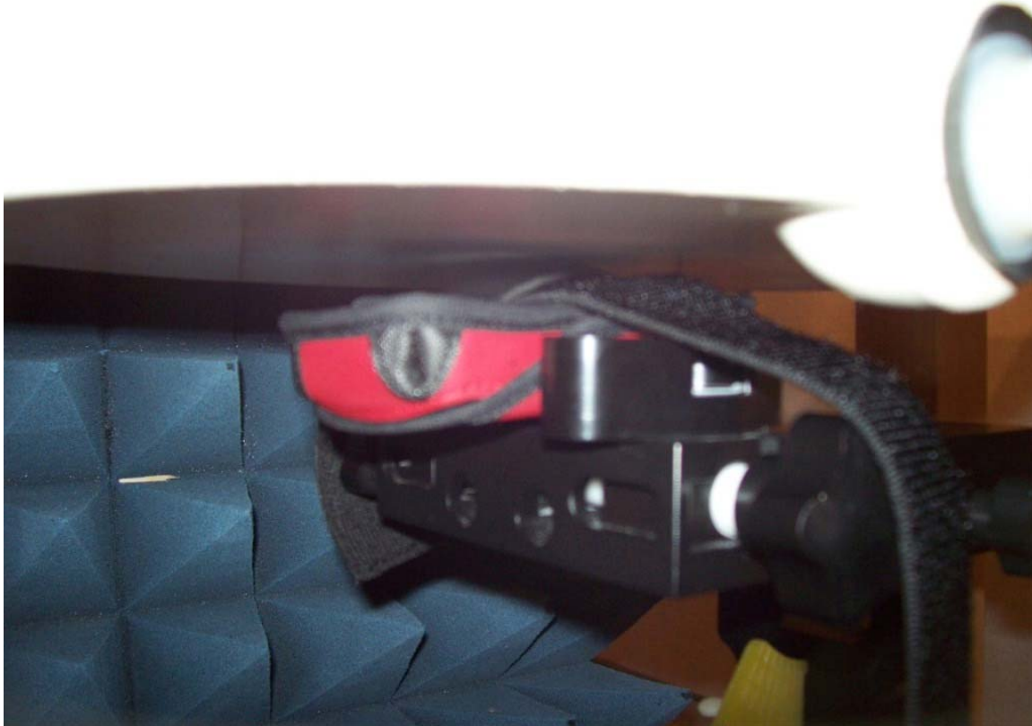
Figure E7. Body-worn configuration (Sportscase with strap, back facing phantom)