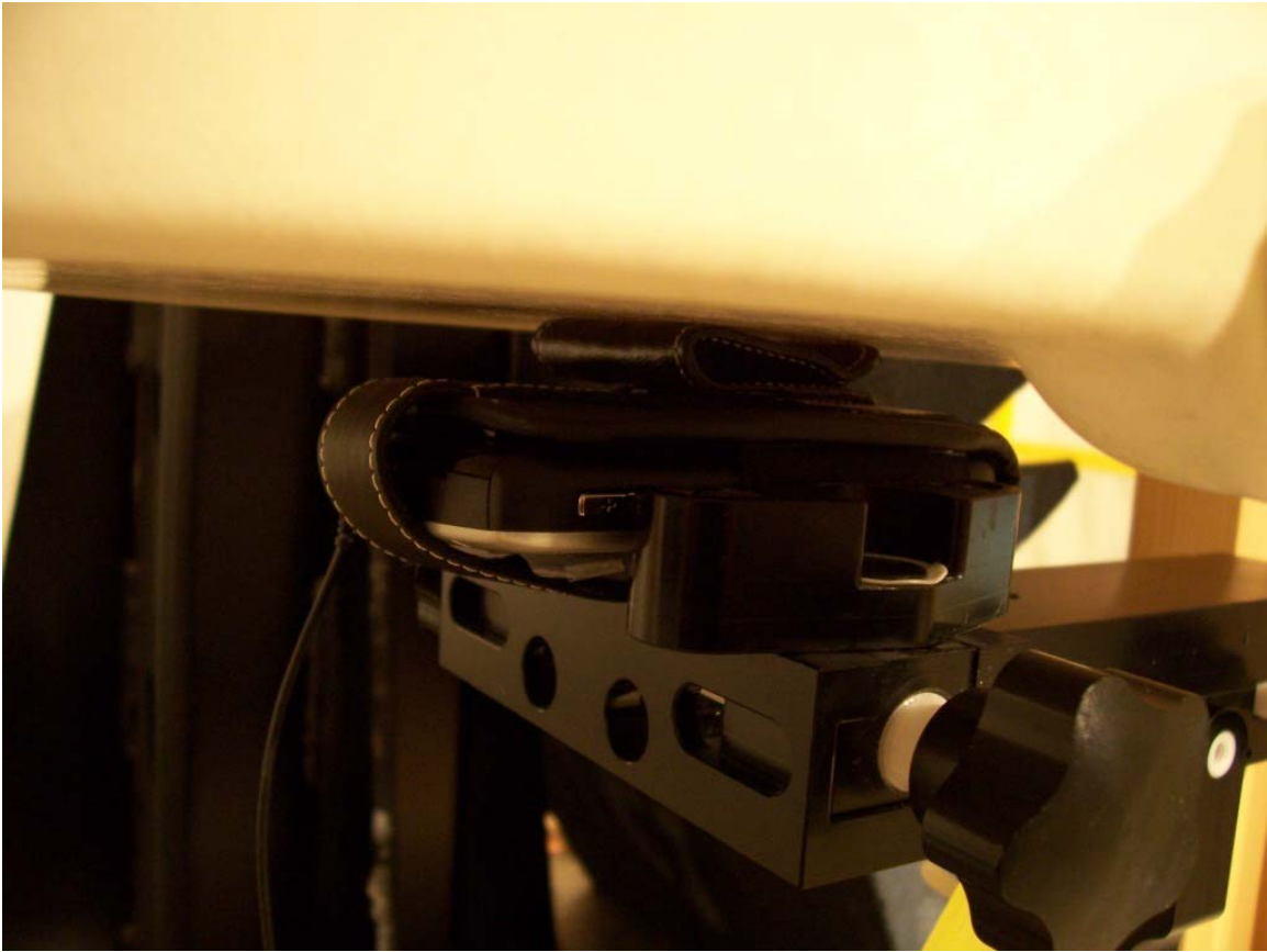
Figure E8. Body-worn configuration (Holster3, headset+BT back facing phantom)