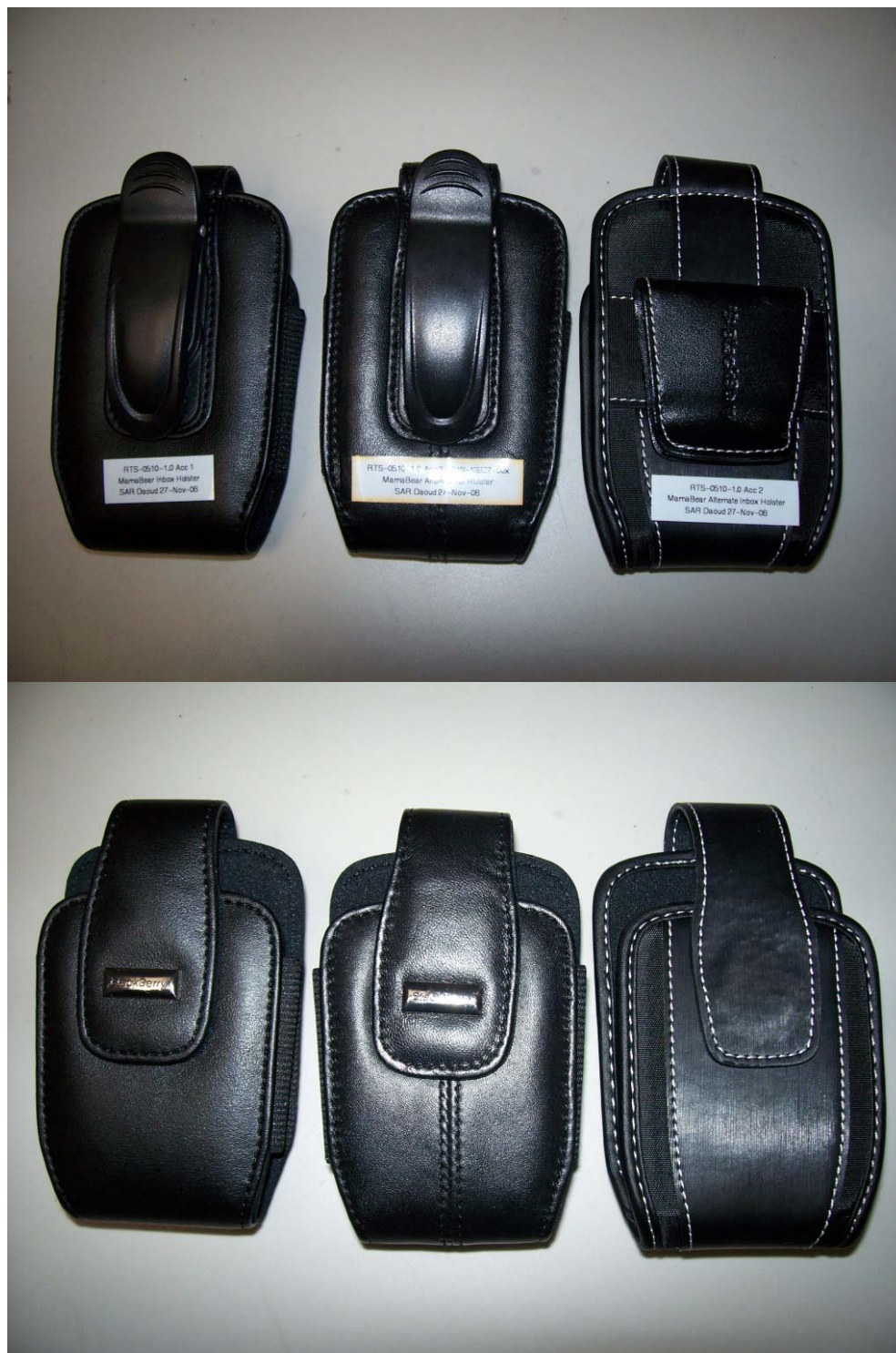
Figure E2. Body worn holsters