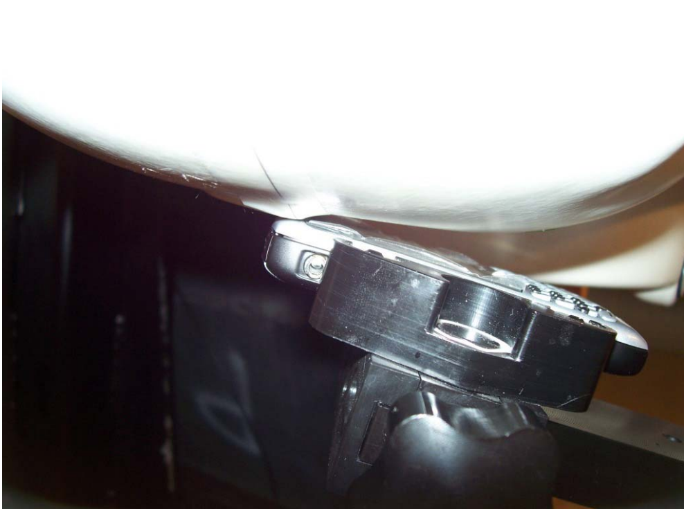
Figure E3. Head configuration (Right Touch/Tilt)