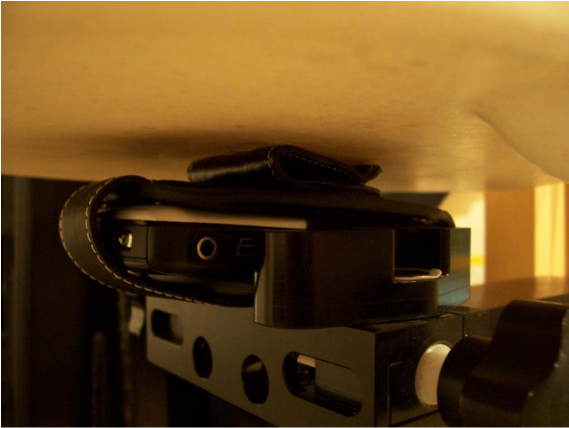
Figure E8. Body-worn configuration (Holster3, front facing phantom)