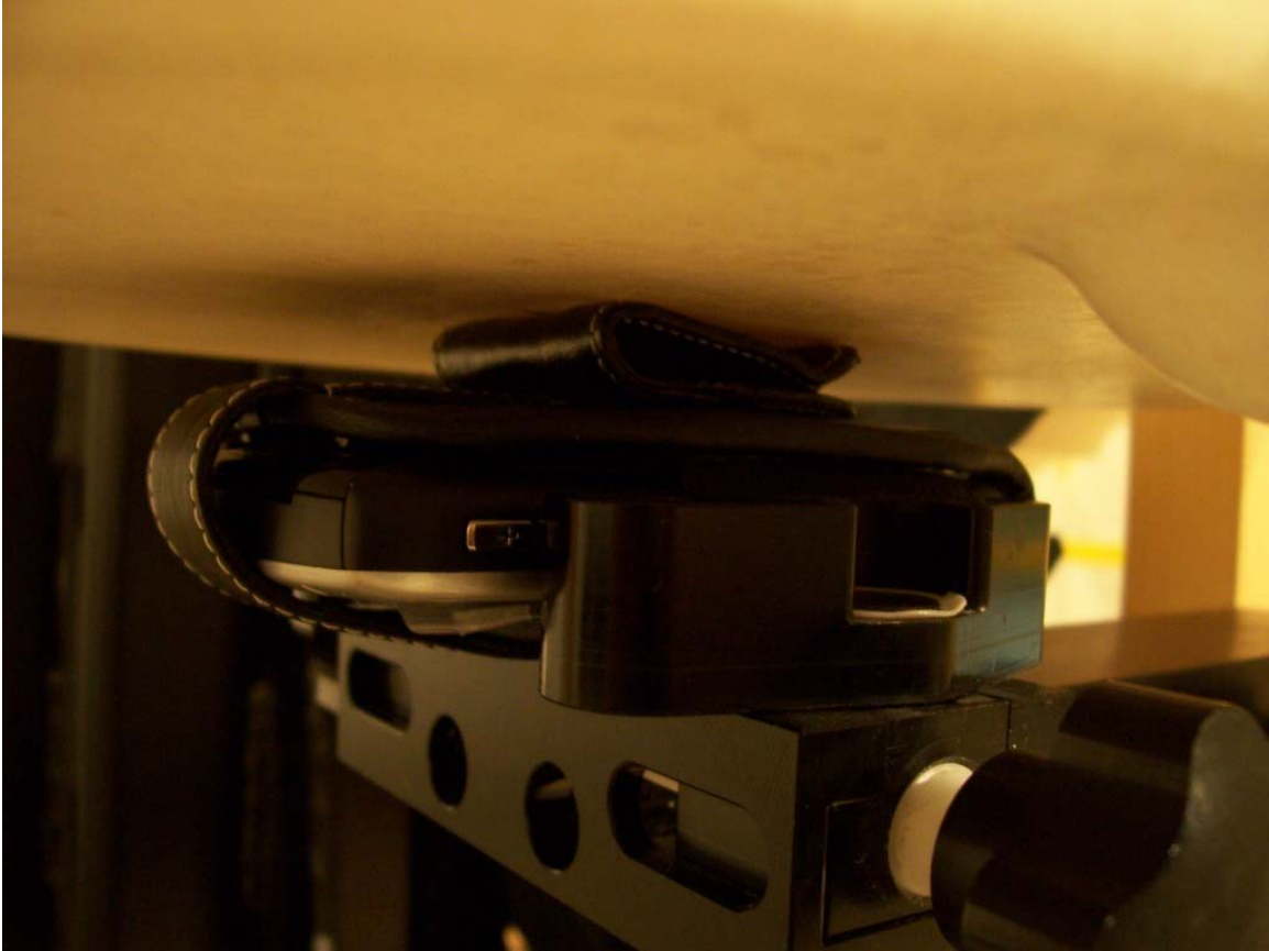
Figure E7. Body-worn configuration (Holster3, back facing phantom)