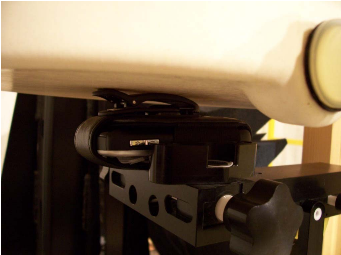
Figure E5. Body-worn configuration (Holster1, back facing phantom)