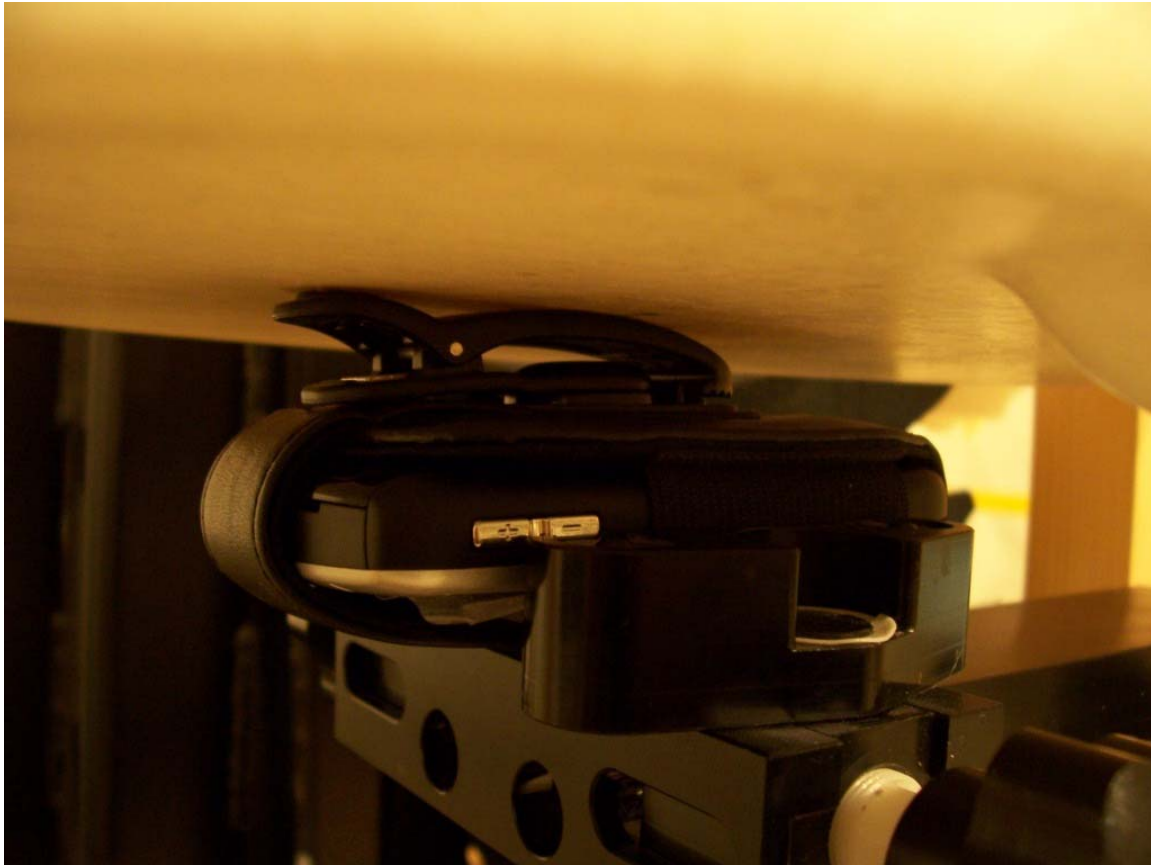
Figure E6. Body-worn configuration (Holster2, back facing phantom)