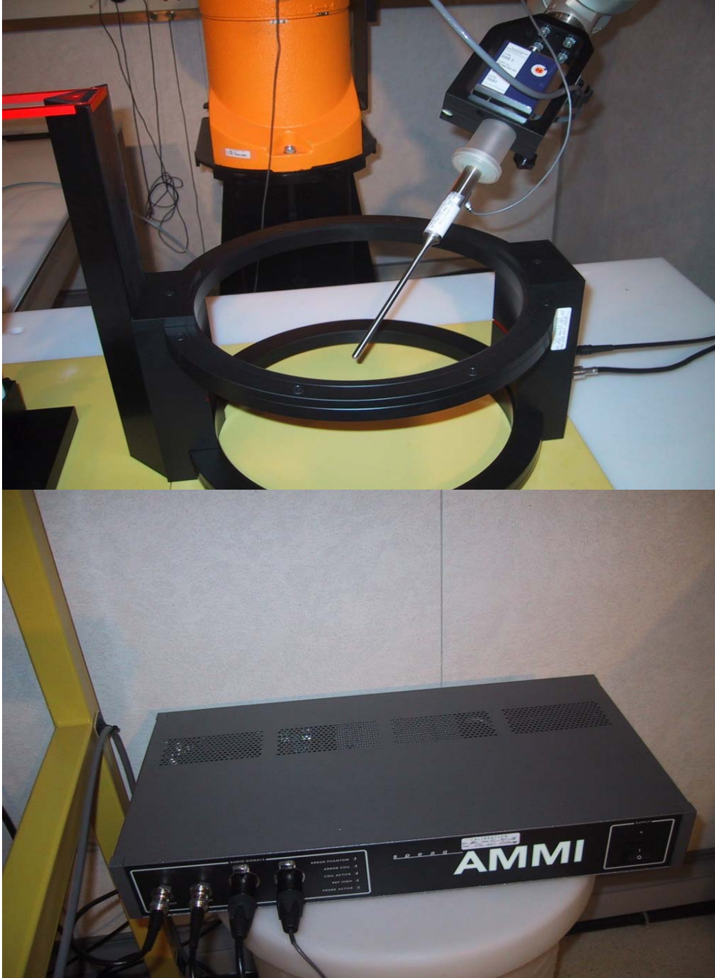
Figure E2: Probe calibration and reference signal measurement setup