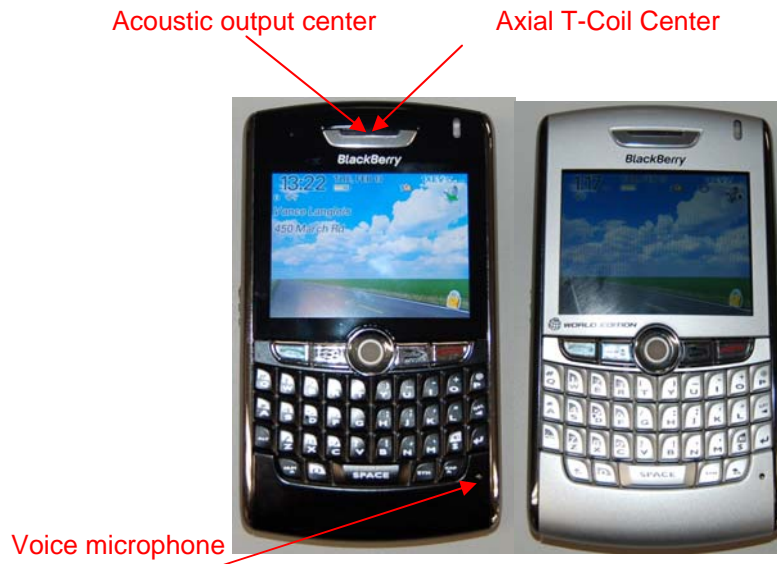
Figure E1: Blackberry® Smartphone