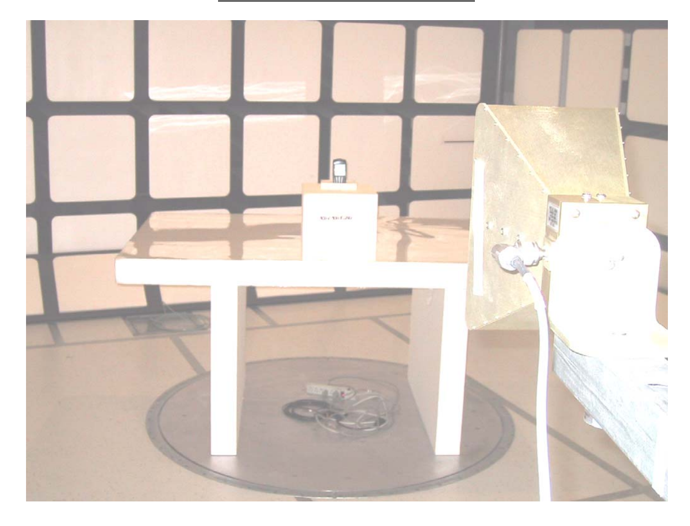
Radiated Emissions at 3.0 metres