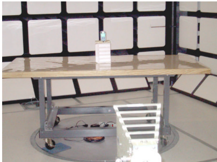
Radiated Emissions at 3.0 metres