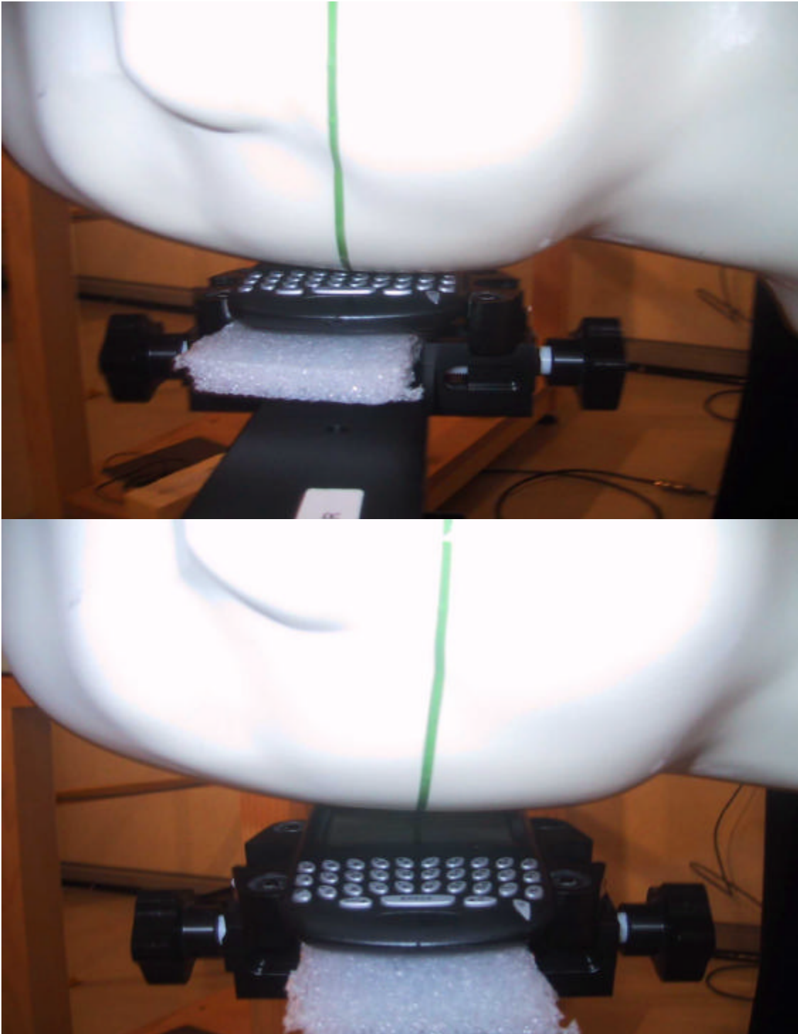
Figure E2. Right ear configuration