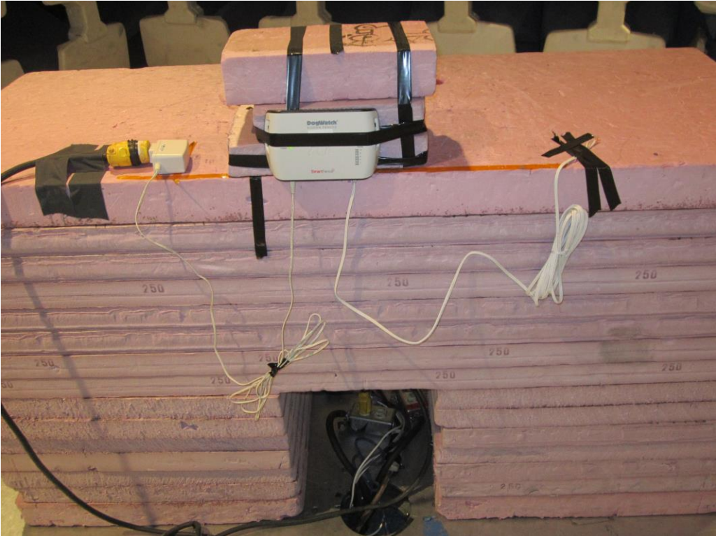
Radiated Emissions – 30 to 1000 MHz (closed up view)