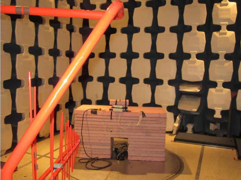
Radiated Emissions – 30 to 1000 MHz

Company: Dogwatch – WO: W1735 - EUT: Smart Transmitter – EUT M/N: SF-T10 FCC ID: L66DWSFT / IC ID: 8187A-DWSFT