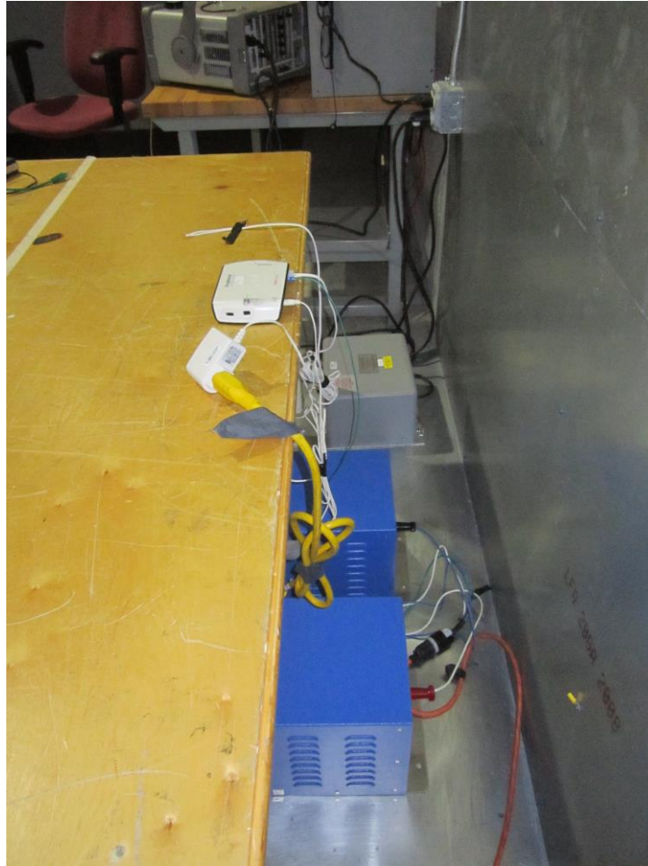
Conducted Emissions (AC Mains) – 0.15 to 30 MHz (rear)

Company: Dogwatch – WO: W1735 - EUT: Smart Transmitter – EUT M/N: SF-T10 FCC ID: L66DWSFT / IC ID: 8187A-DWSFT