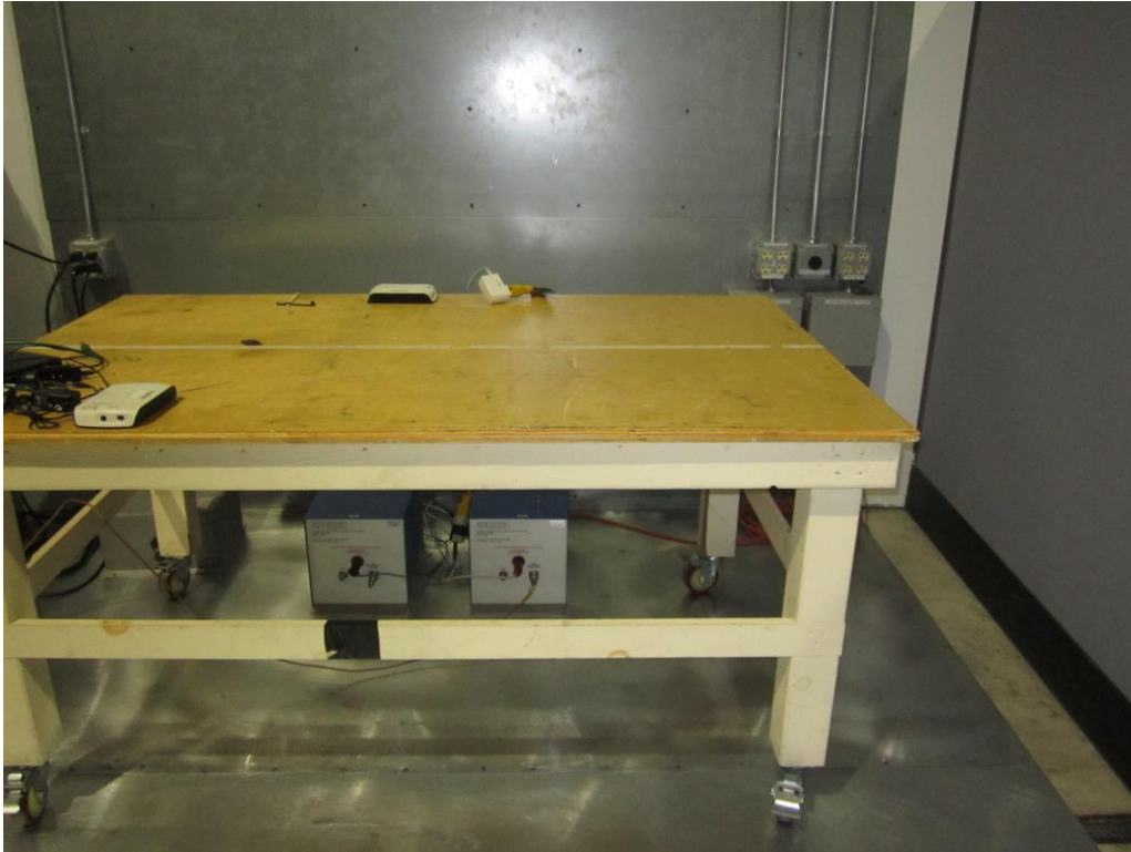
Conducted Emissions (AC Mains) – 0.15 to 30 MHz (front)

Company: Dogwatch – WO: W1735 - EUT: Smart Transmitter – EUT M/N: SF-T10 FCC ID: L66DWSFT / IC ID: 8187A-DWSFT