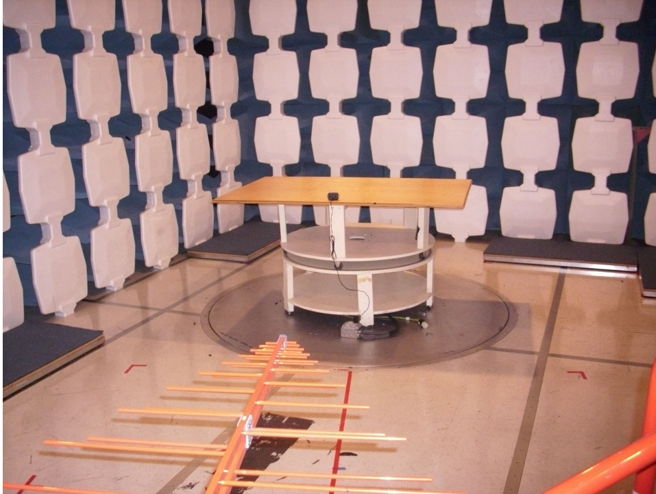
Radiated Measurements below 1GHz in Anechoic Chamber – Verification