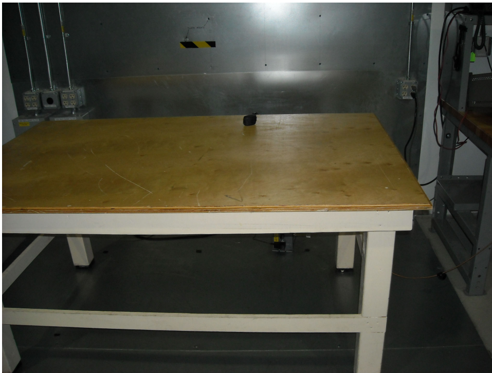
AC Line Conducted Emissions – Front – Verification