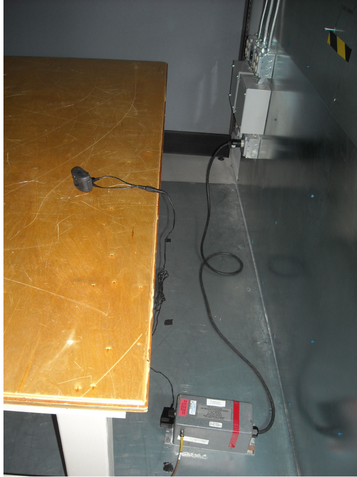
AC Line Conducted Emissions – Rear - Verification