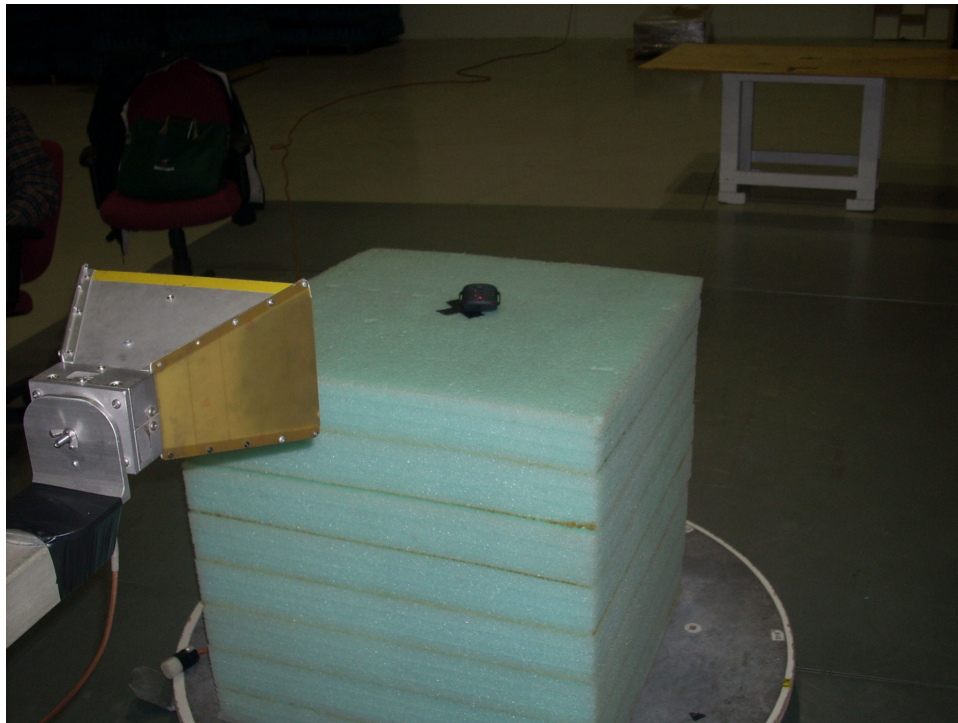
Radiated Measurements Above 1GHz