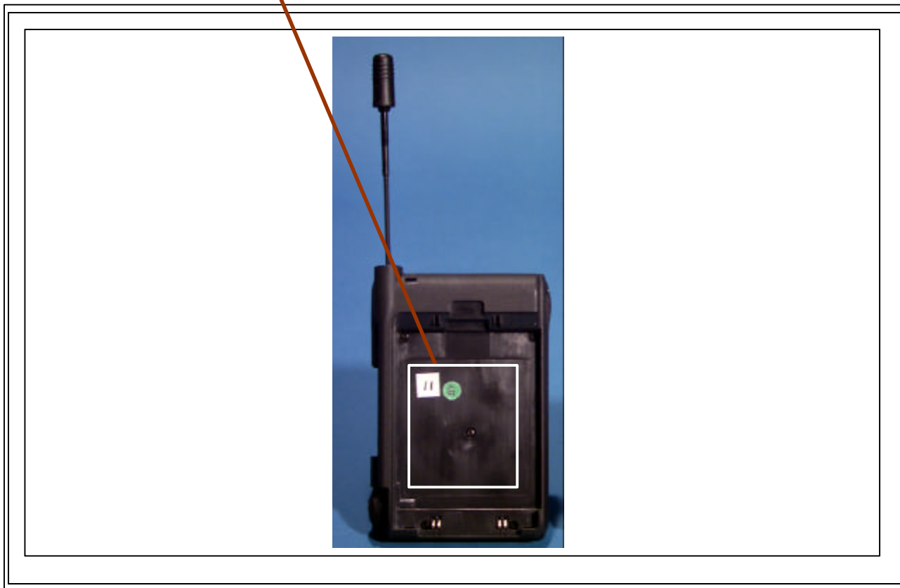
Fig 12. Sample label

The Label shown shall be permanently affixed at a conspicuous location on the device and be readily visible to the user at the time of purchase.