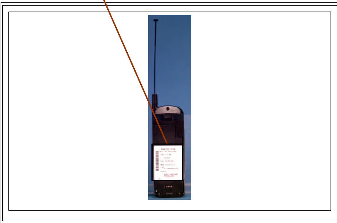
Fig 12. Sample label

The Label shown shall be permanently affixed at a conspicuous location on the device and be readily visible to the user at the time of purchase.