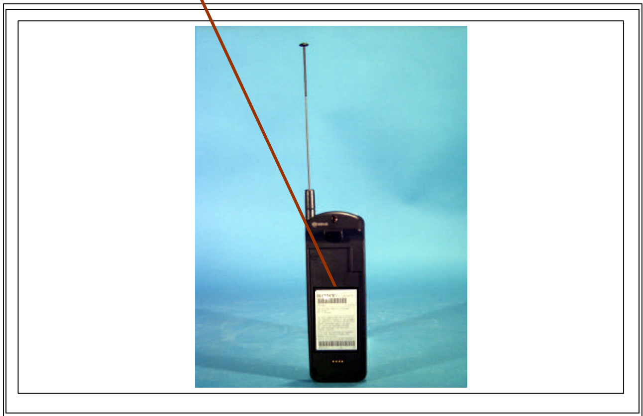
Fig 12. Sample label

The Label shown shall be permanently affixed at a conspicuous location on the device and be readily visible to the user at the time of purchase.