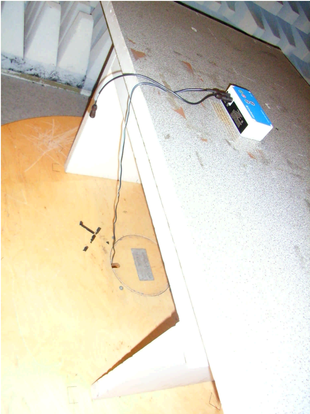
80535_EMI41.jpg Test set-up radiated emission test

Annex A of test report F080535E6 EUT: CT-DECT Conference (8) Manufacturer: CeoTronics AG