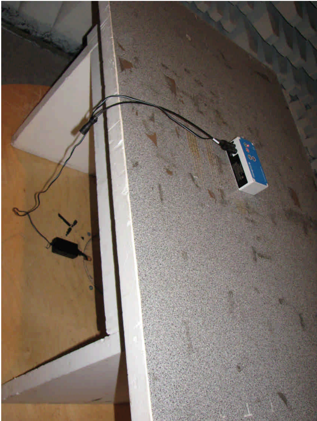
80535_EMI51.jpg Test set-up radiated emission test

Annex A of test report F080535E7 EUT: CT-DECT Conference (4) Manufacturer: CeoTronics AG