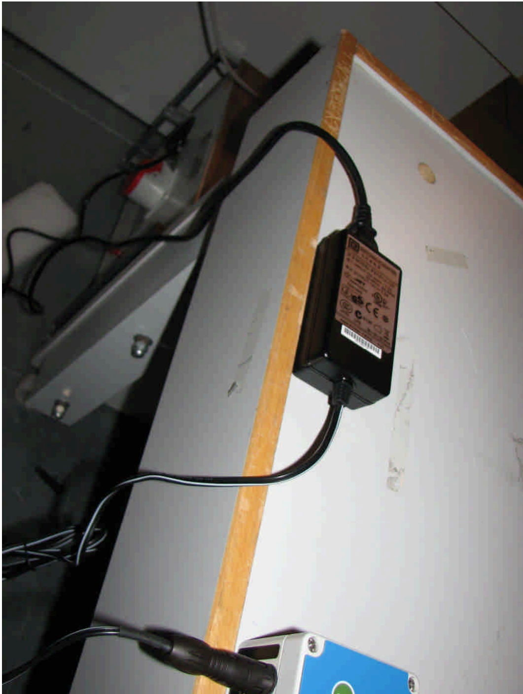
80535_AC50.jpg Test set-up conducted emission

Annex A of test report F080535E7 EUT: CT-DECT Conference (4) Manufacturer: CeoTronics AG