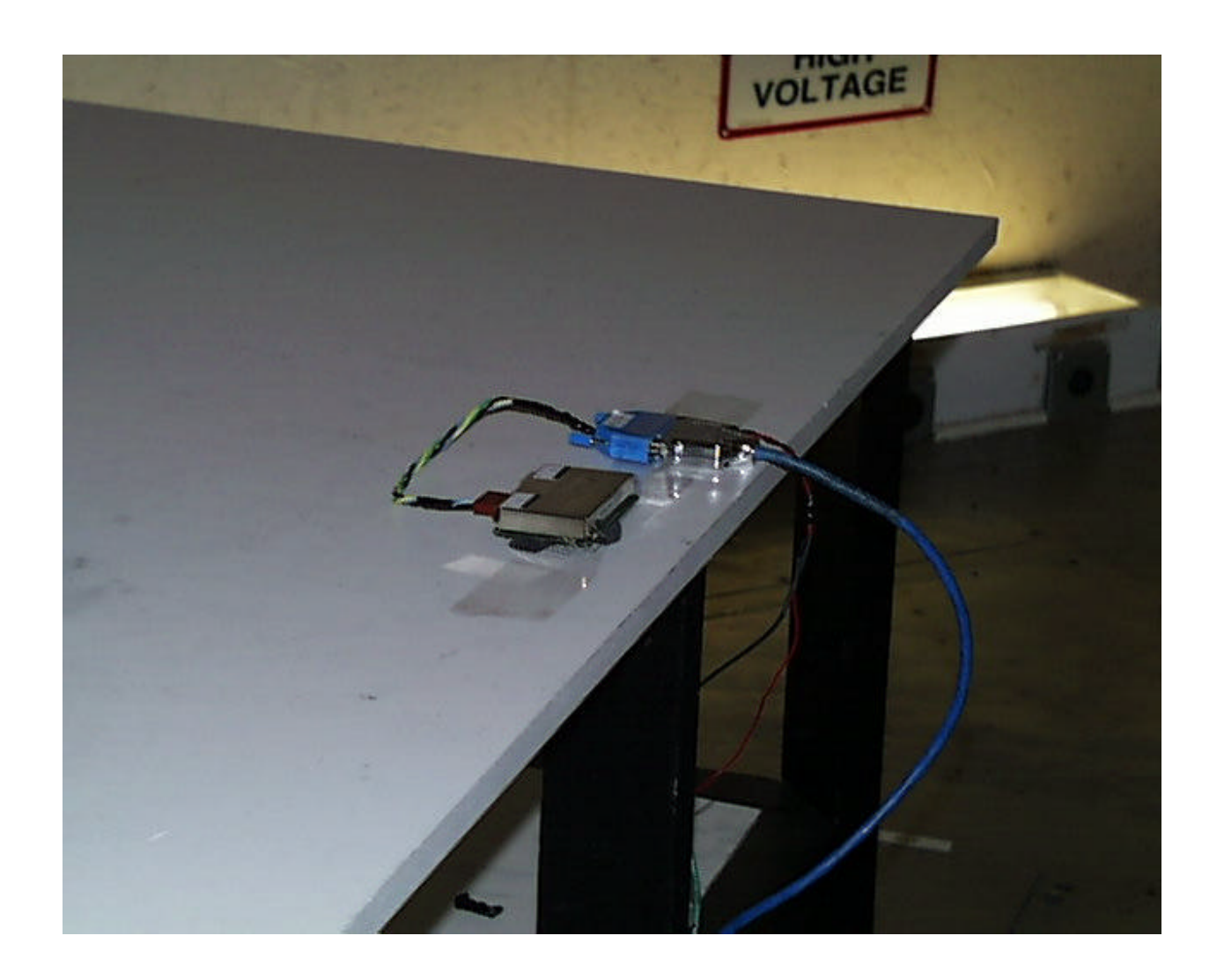
Figure 3.9 - 2: Worst Case Radiated Emission, Rear View