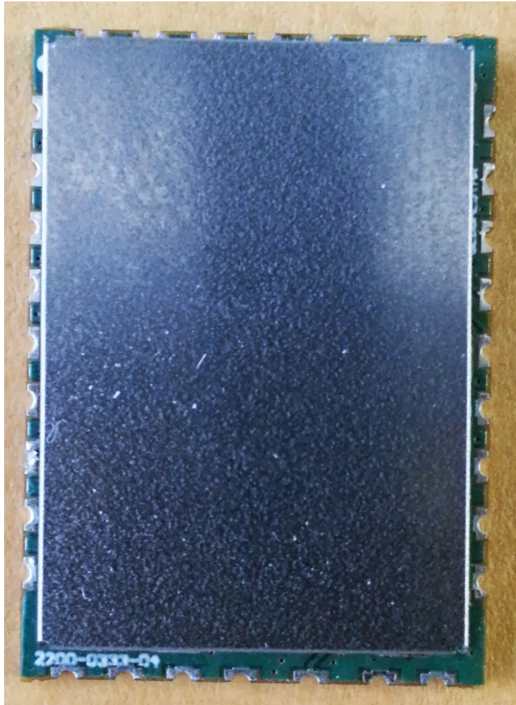
Figure 3 Transmitter Board (Top) Shield Installed