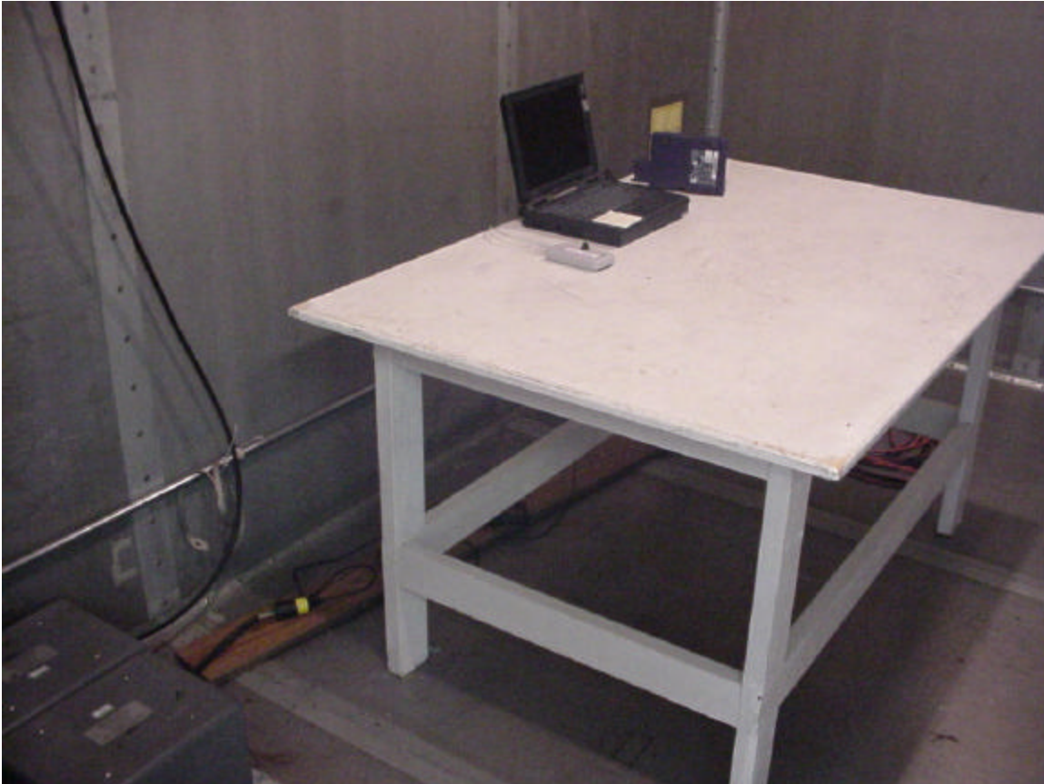
Photograph(s) for Conducted Emissions