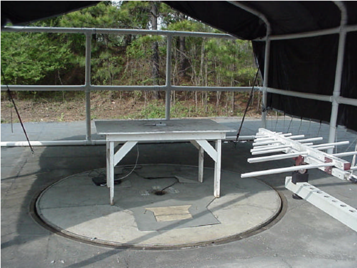
Photograph(s) for Spurious Emissions (Front)