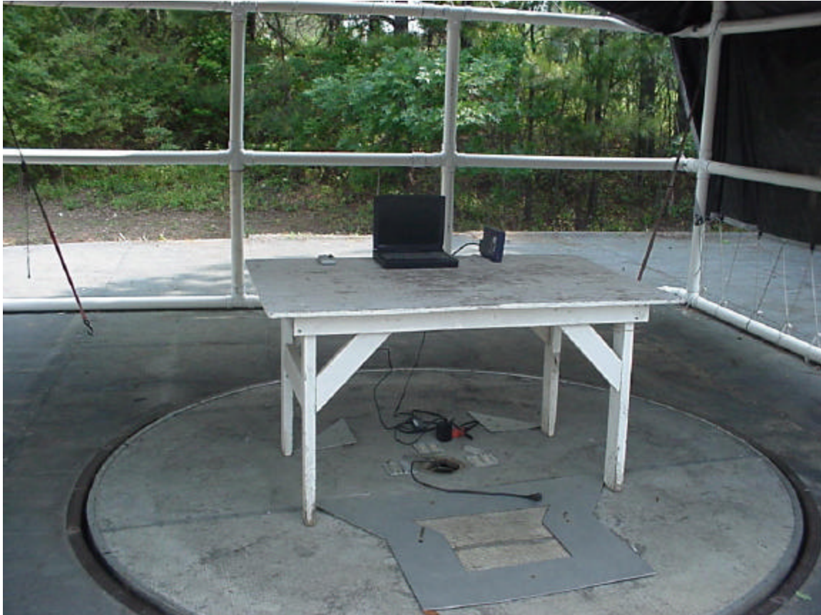
Photograph(s) for Digital Emissions (Front)