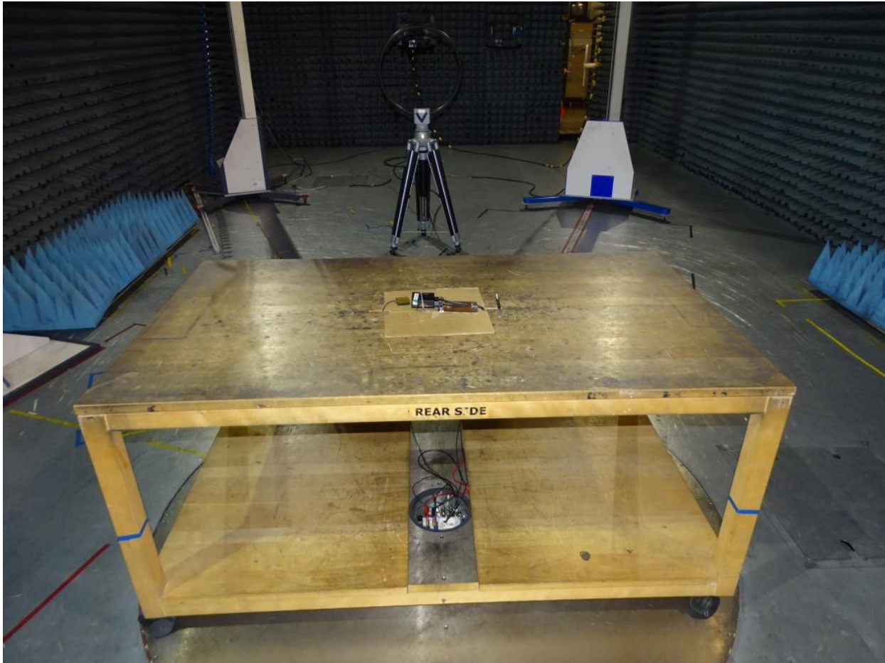
Photo 1: Test setup for radiated measurements (Enclosure, below 30 MHz, intentional radiator §15.209, ANSI C63.10)