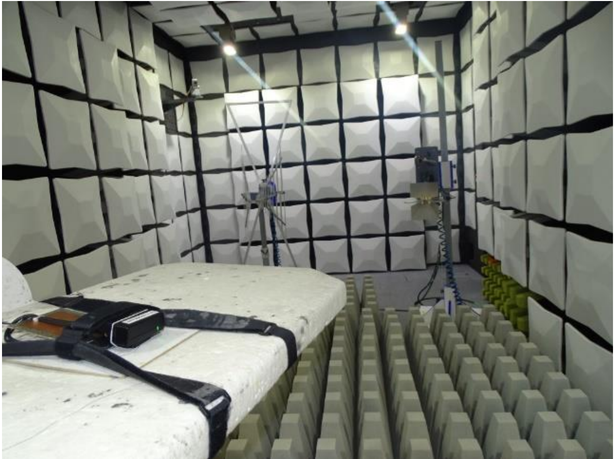
Photo 3: Test setup for radiated measurements (Enclosure, fully-anechoic chamber, 1-26 GHz intentional radiator §15)