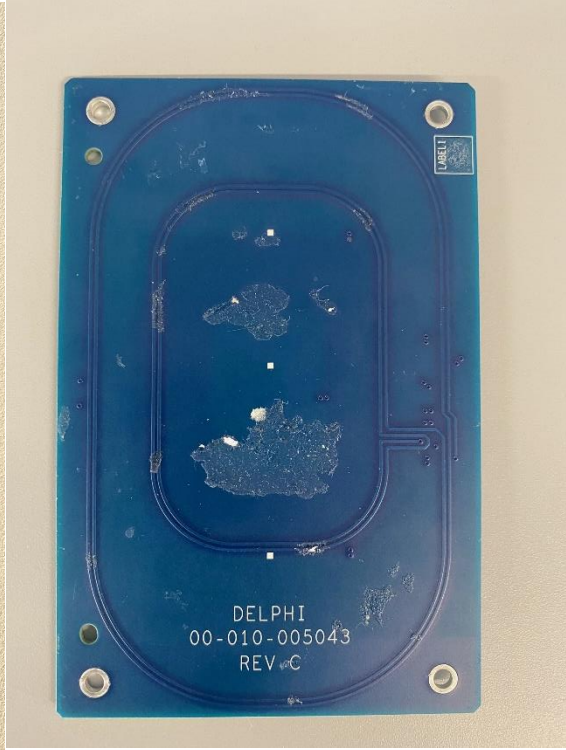
Coil/Antenna PCB Bottom