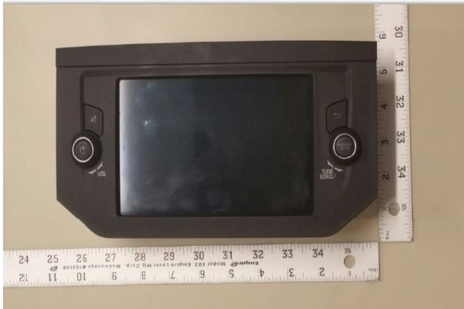
Figure B1: Top view DUT