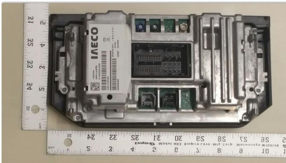
Figure B2: Rear view DUT