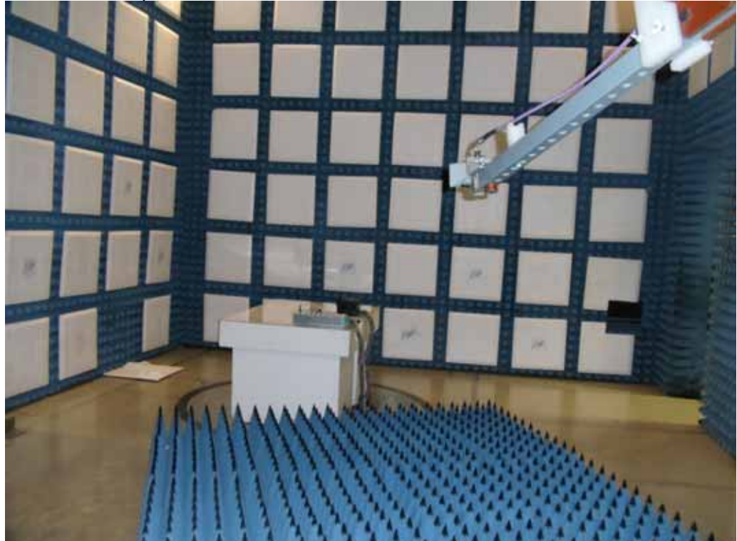
Test Setup for Radiated Emissions, above 1GHz – Vertical Polarization