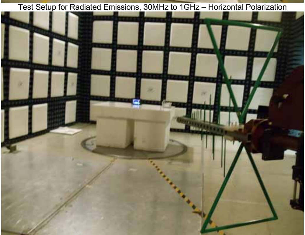
Test Setup for Radiated Emissions, 30MHz to 1GHz – Vertical Polarization