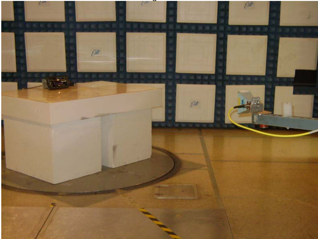
Test Set-up for Radiated Emissions – 2GHz to 18GHz, Horizontal Polarization