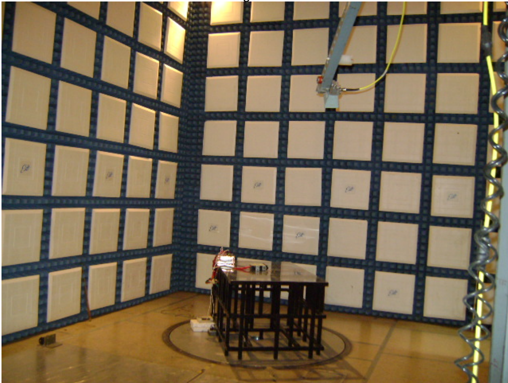
Test Setup for Radiated Emissions – 2GHz to 18GHz, Horizontal Polarization