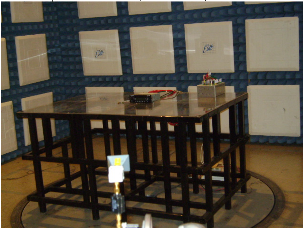
Test Setup for Radiated Emissions, 18GHz to 25GHz, Vertical Polarization