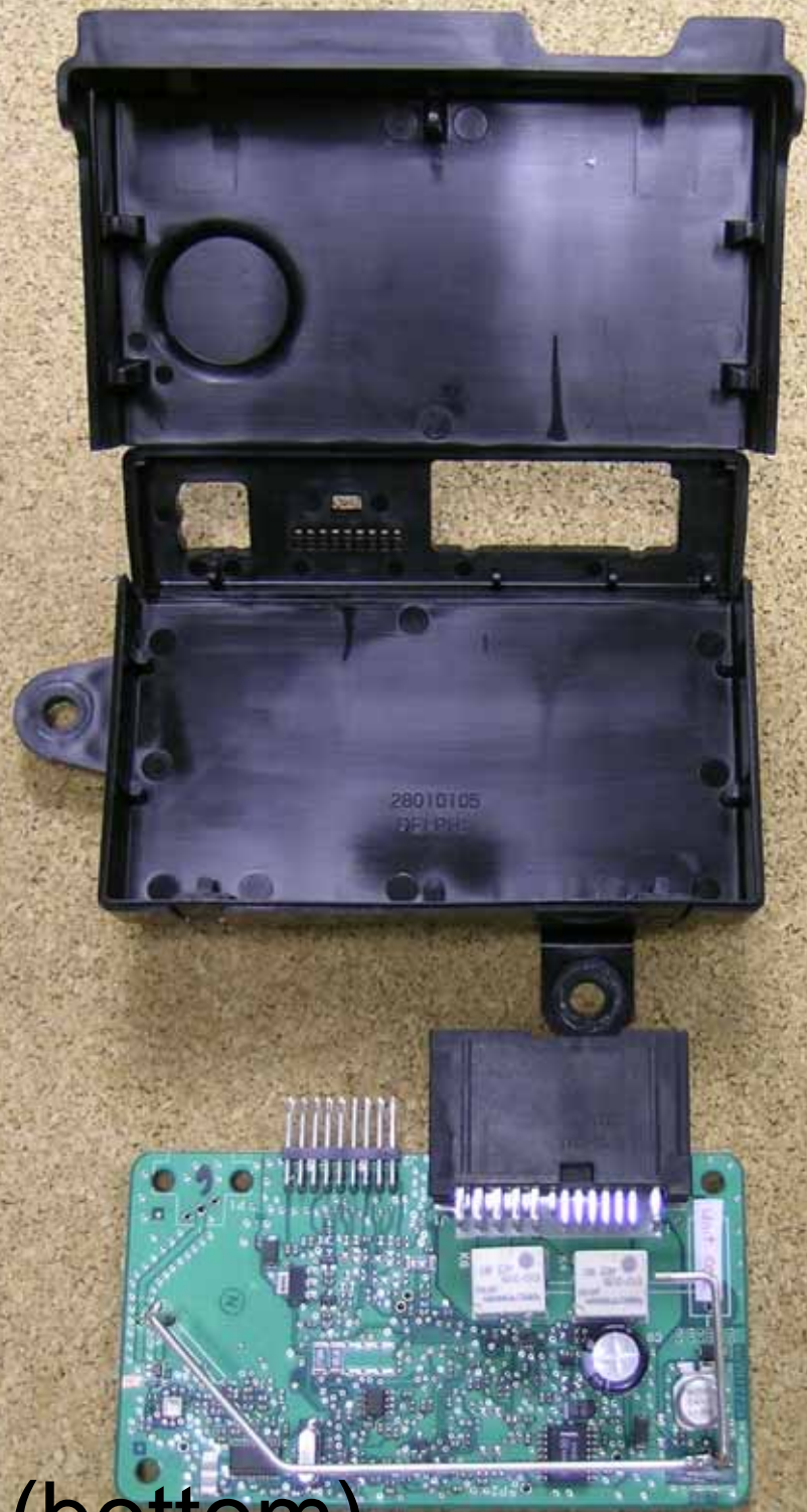
DUT apart (bottom)