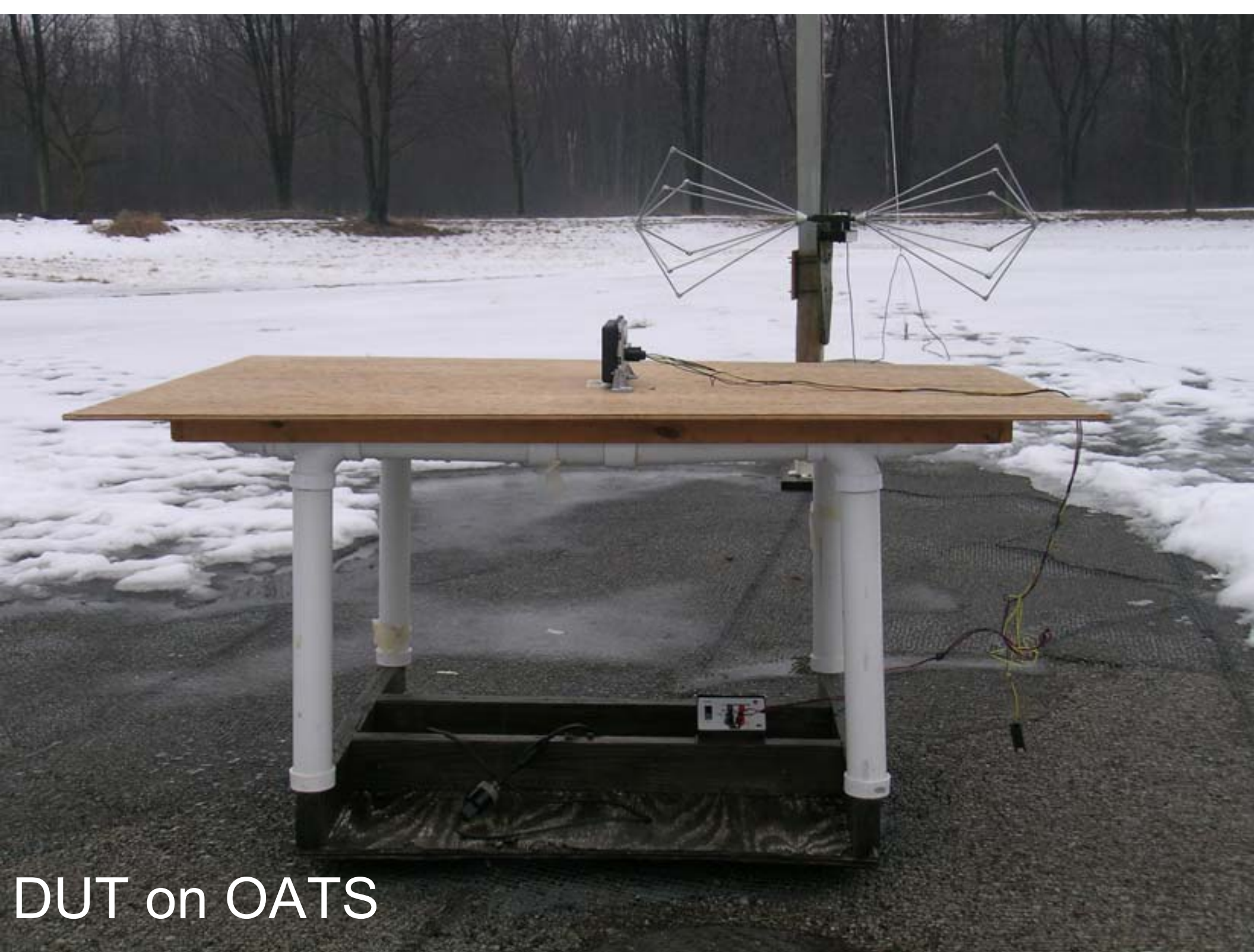
DUT on OATS