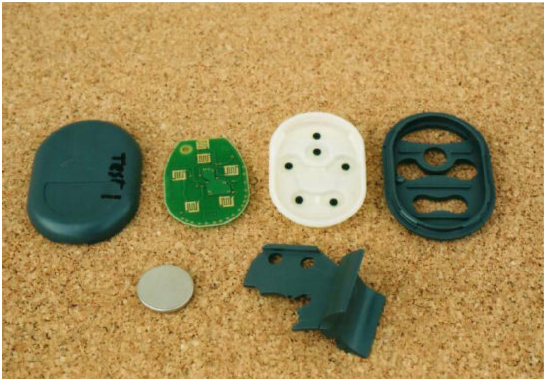
DUT Open, bottom