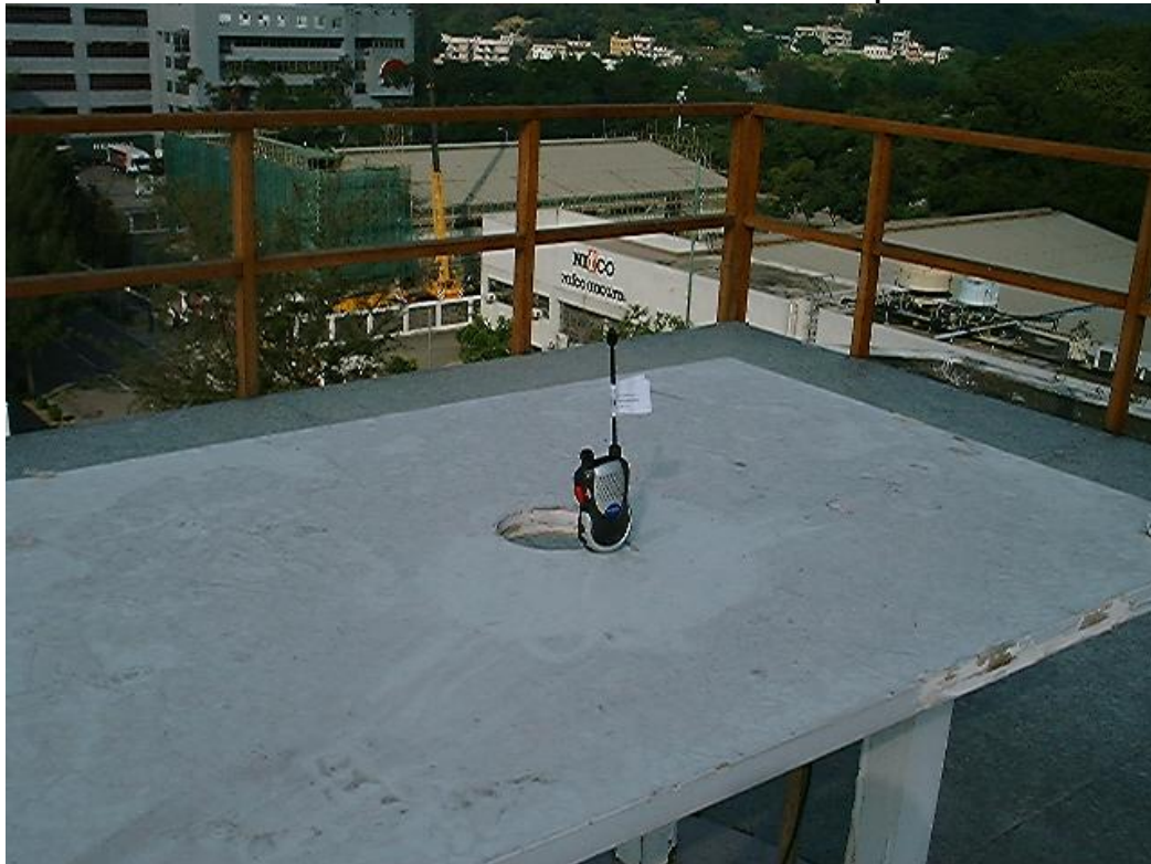
Measurement of Radiated Emission Test Set Up