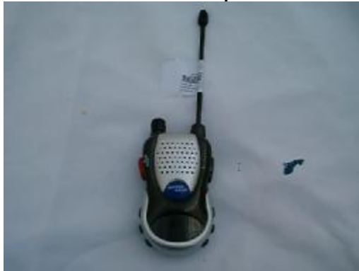
Front View of the product