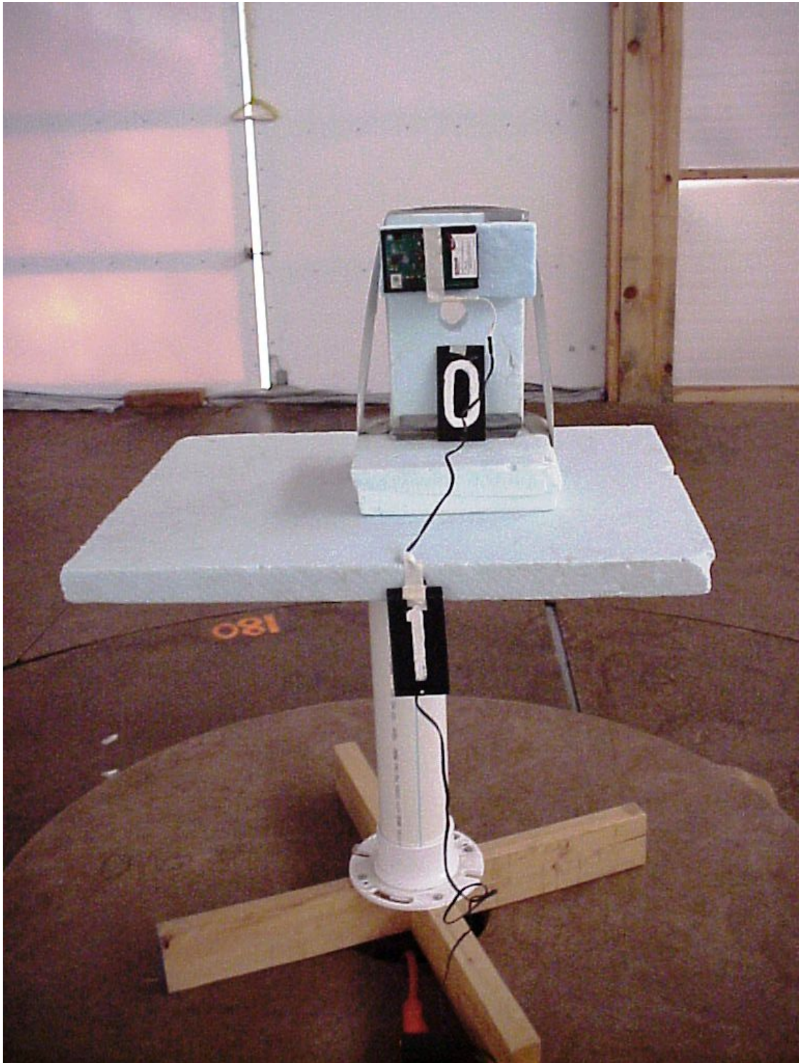
FRONT VIEW "X" AXIS