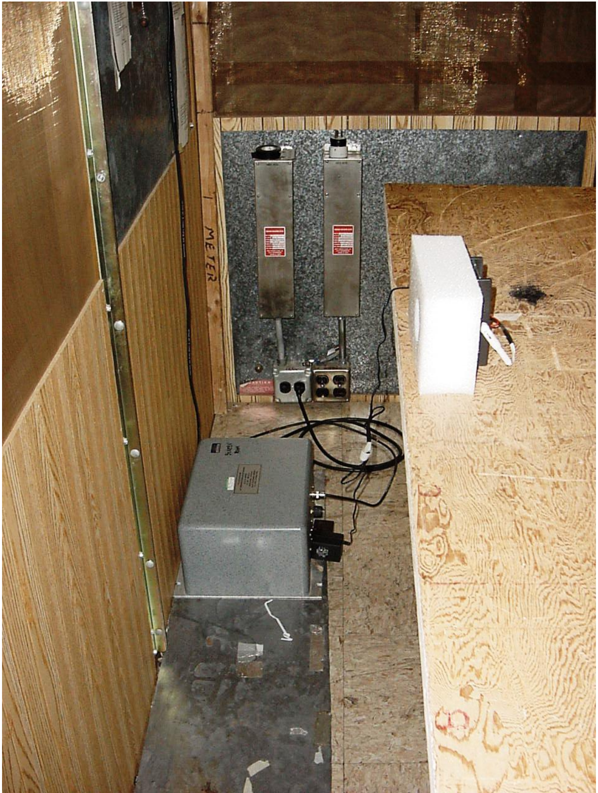
AC LINE CONDUCTED