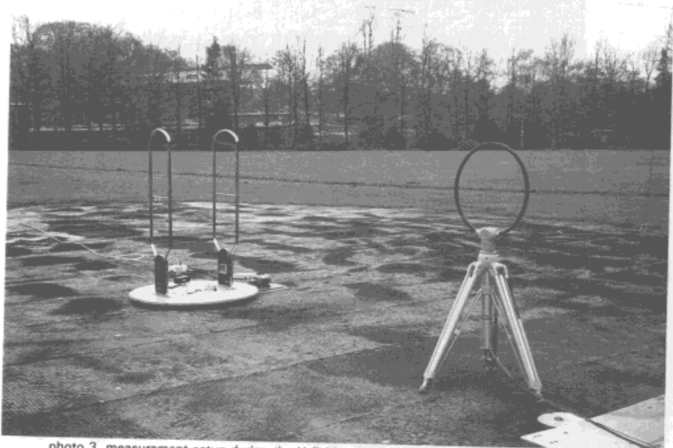
photo 3, measurement setup during the H-field emission measurements at 3 meter