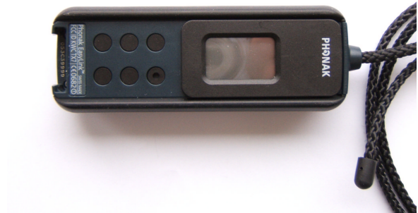
Fig. 7: EasyLink from bottom