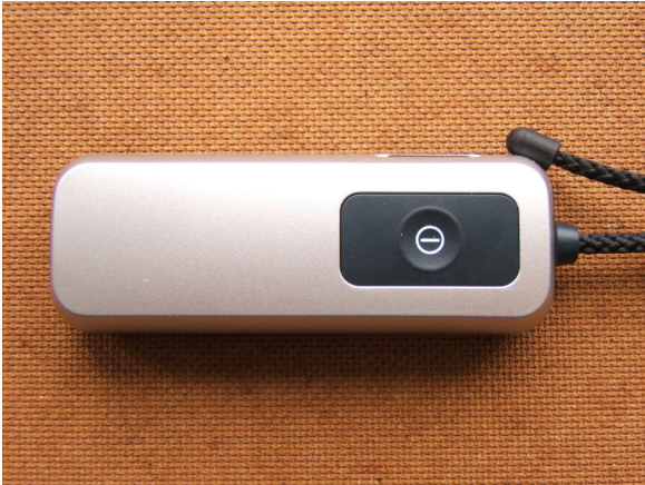
Fig. 6: EasyLink from top