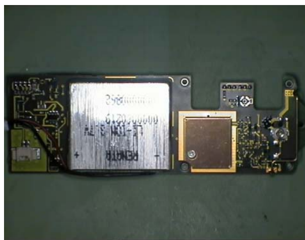
Fig 3: Print 1 upper side with Li-Ion Battery