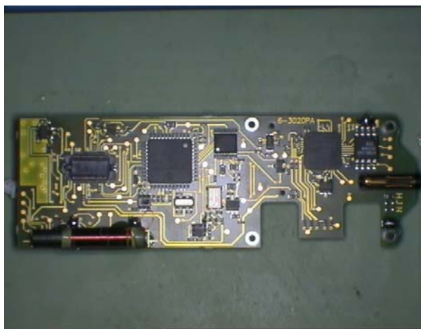
Fig 2: Print 1 lower side

SmartLink SX has two prints with electronics on it which are plugged together.