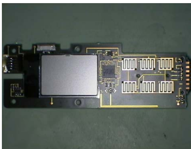
Fig 4: Print 2 lower side with LCD display