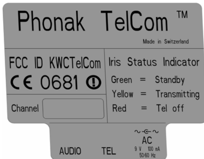
fig. 2 ID Label