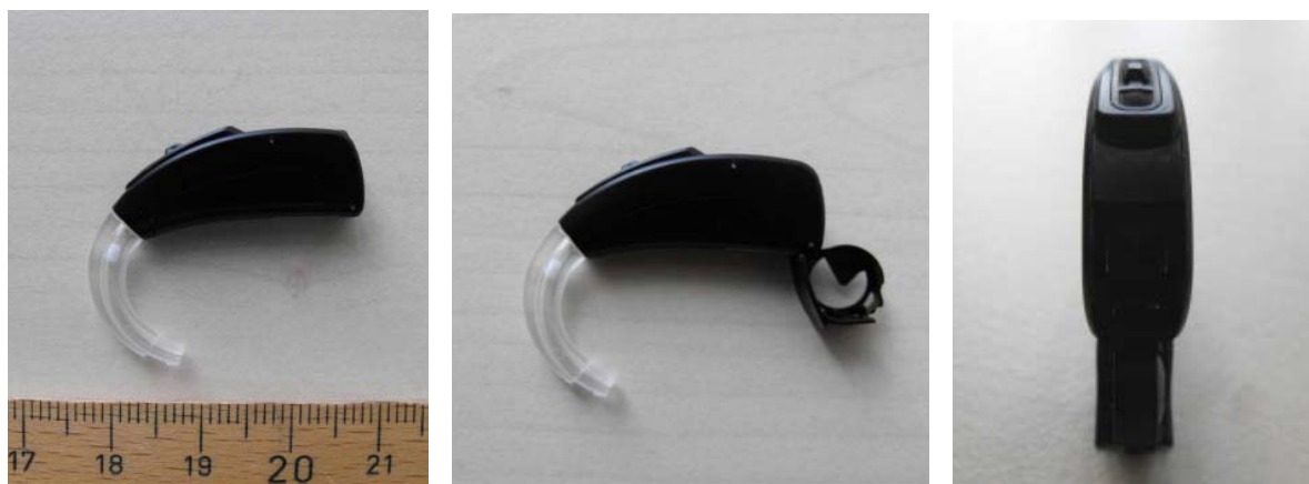
Figure 2: Phonak Ambra microM - battery compartment, current serial number size is about 2 points