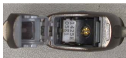
Figure 2: Phonak Audeo V battery compartment, current serial number size is about 2 points