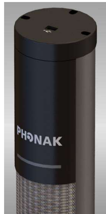
Brand name Phonak