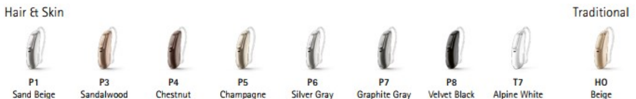
Figure 2b: colors Phonak Audéo M-R models

Phonak Audéo M-R models, which are subject of this certification, are available in the following colors