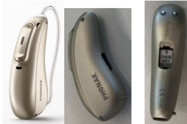
Phonak Audéo M-R