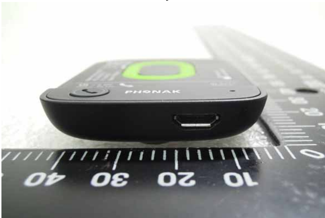
Data Cable (USB)