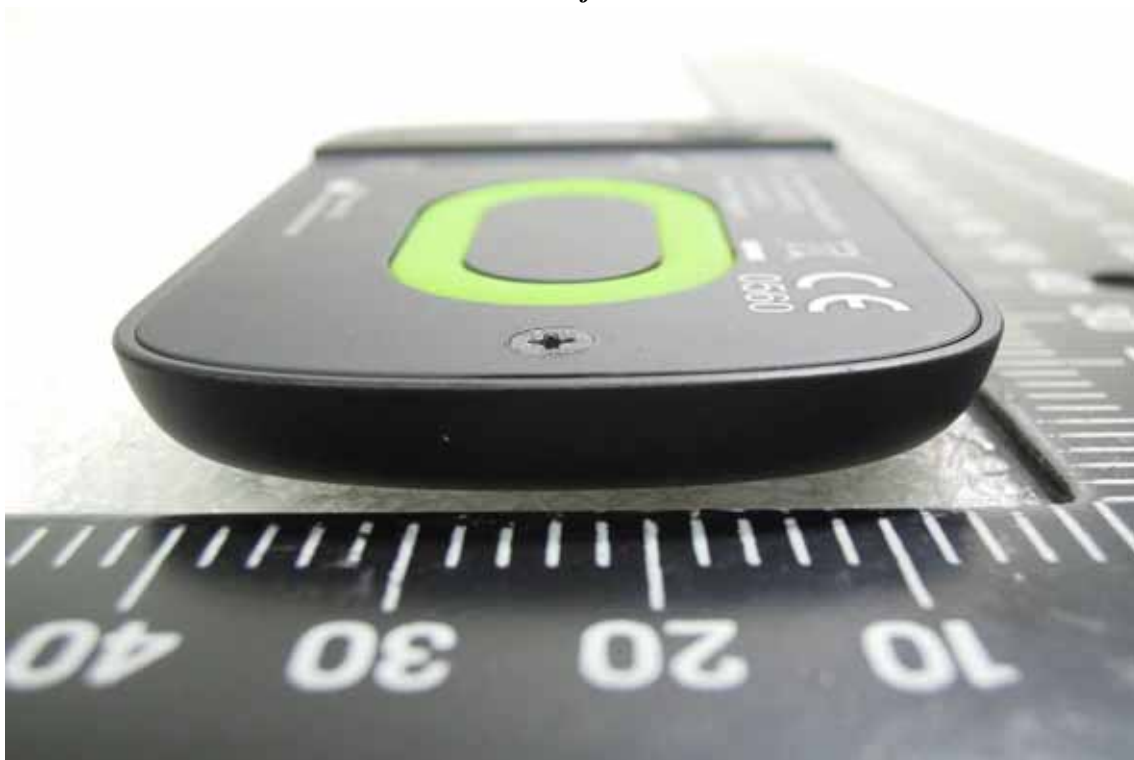
Side View of EUT – 3