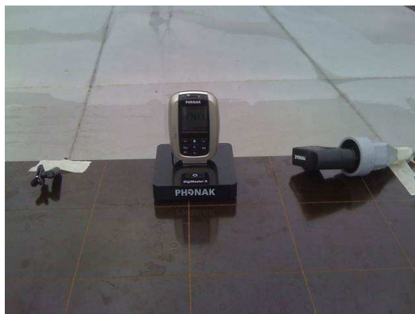
Power supply n°1