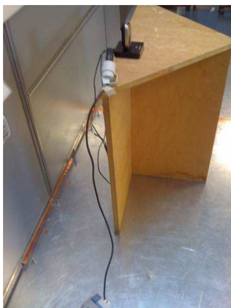
Setup with AC/DC adaptor