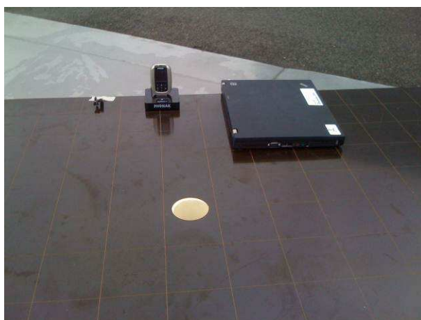
Power supply n2