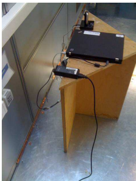
Setup with Laptop