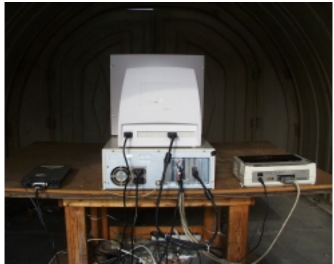
Radiated Emission Setup Photos (Worst Emission Position)