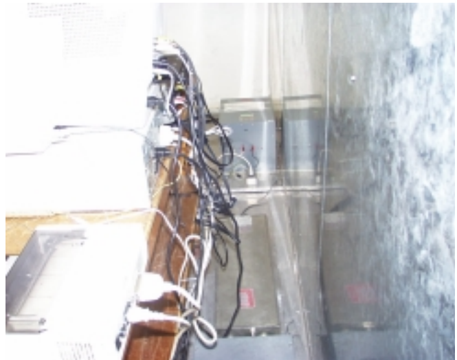
Conducted Emission Setup Photos (Worst Emission Position)