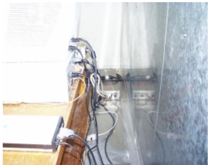
Conducted Emission Setup Photos (Worst Emission Position)