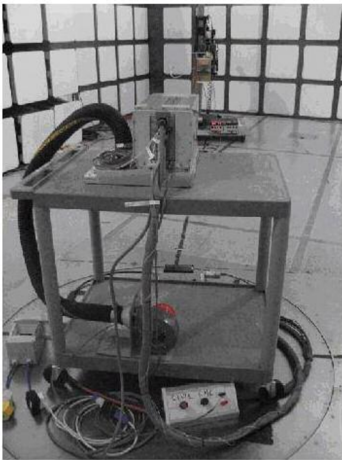
Radiated Emissions – 1 GHz to 18 GHz