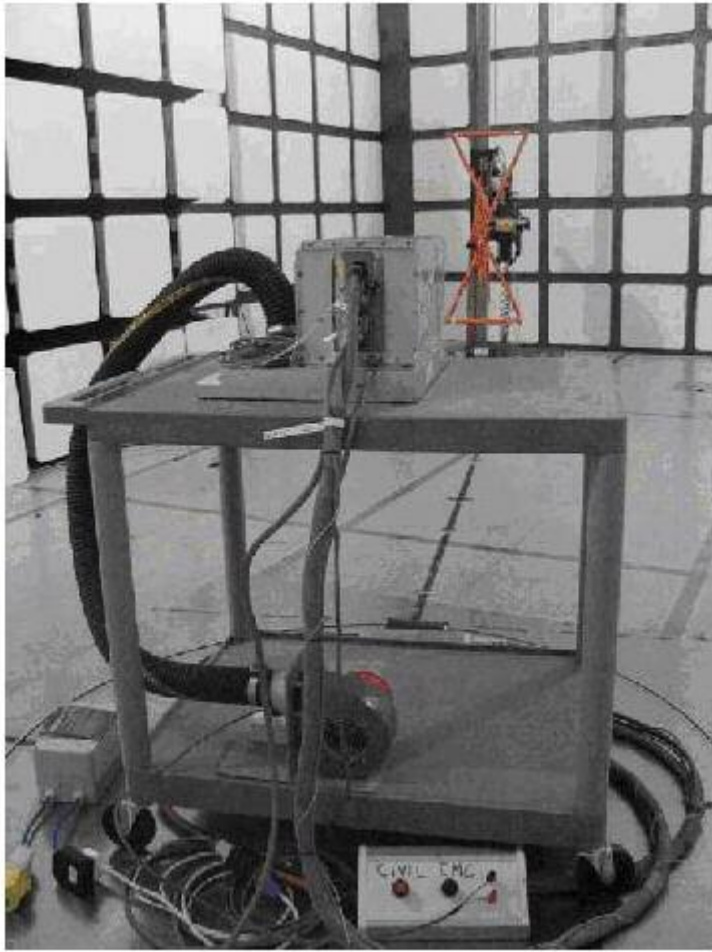
Radiated Emissions – 30 MHz to 1 GHz