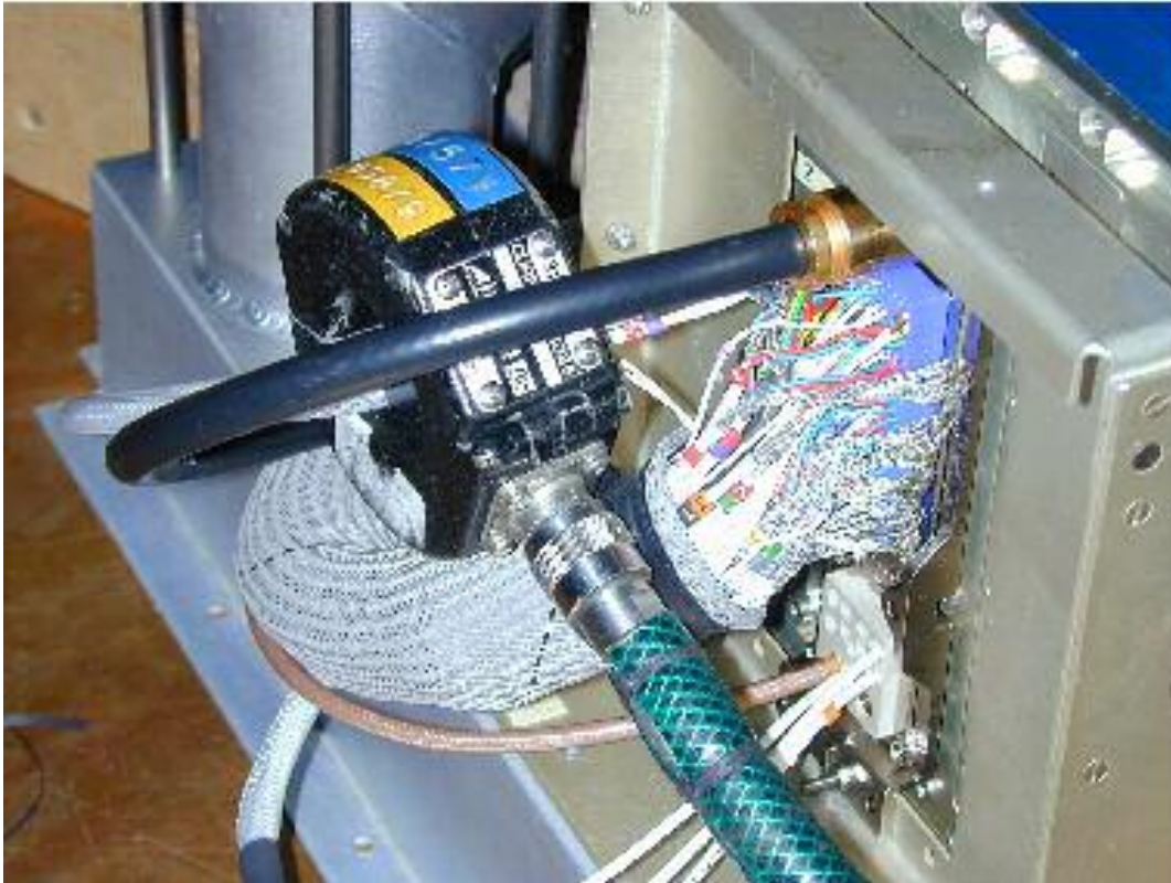
Figure 1: Conducted Emissions