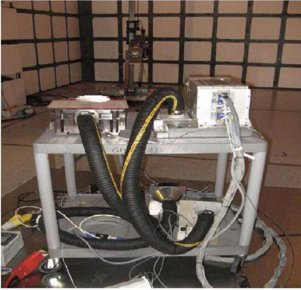
Radiated Emissions – 1 GHz to 18 GHz