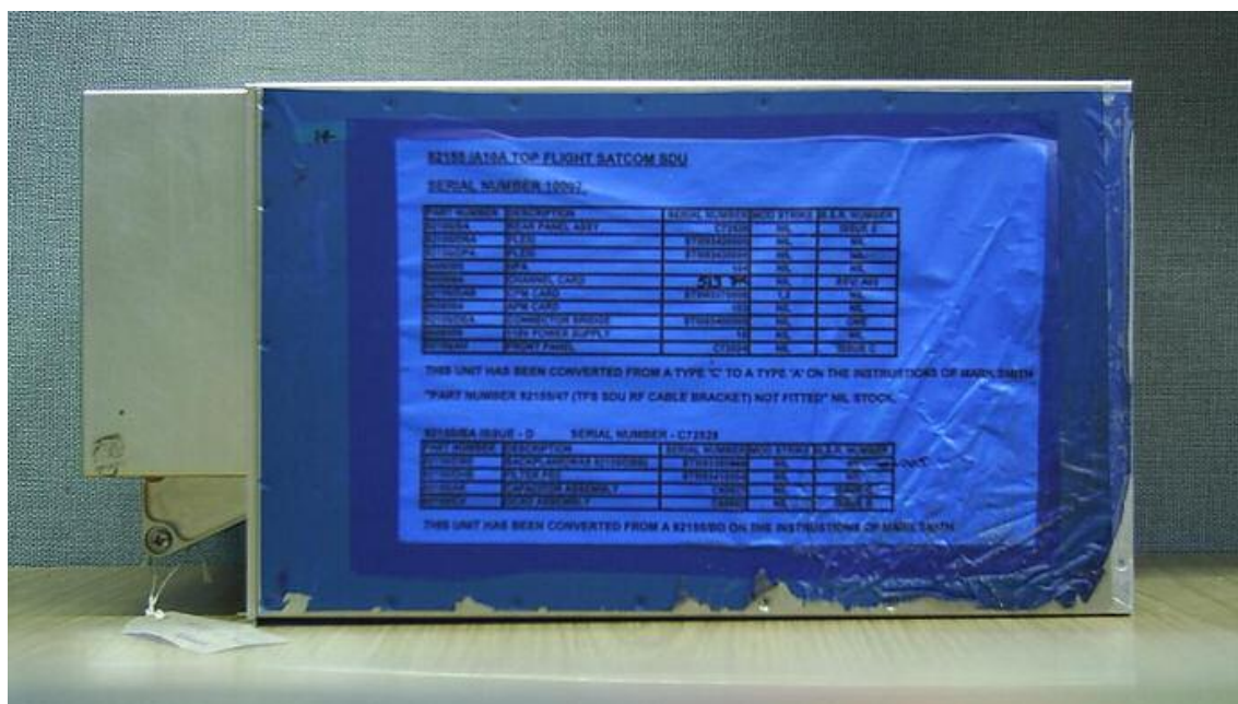
Figure 4: SDU Left