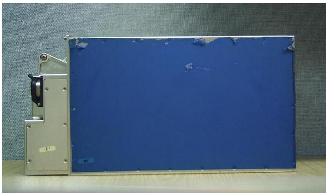
Figure 6: SDU Right