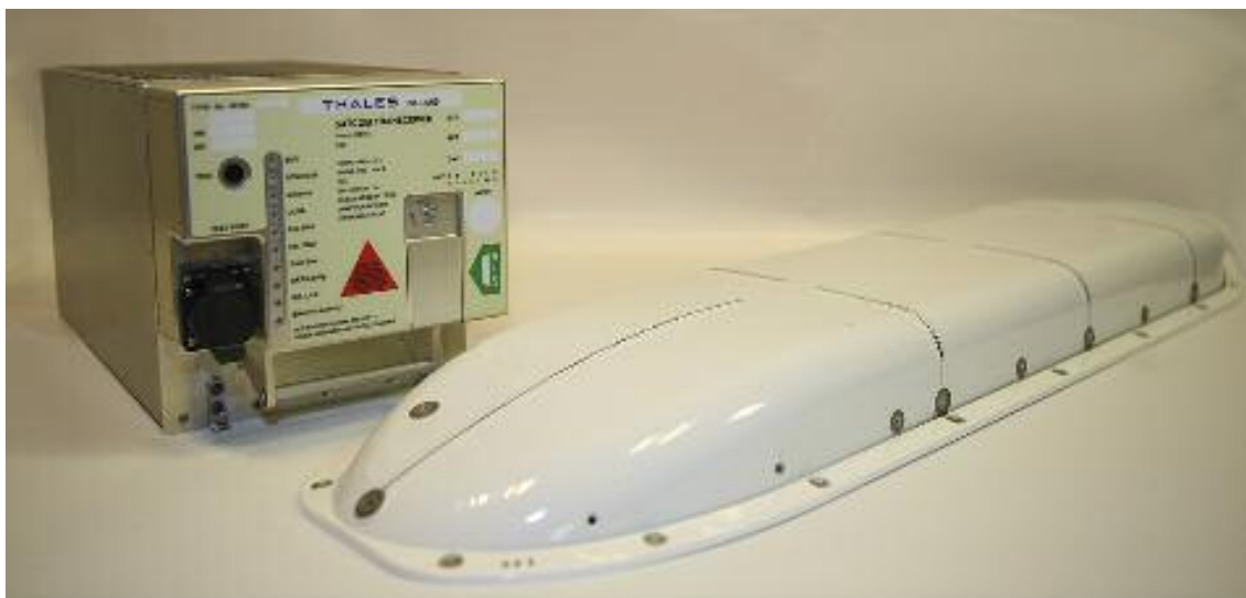
Figure 7: SDU with Antenna