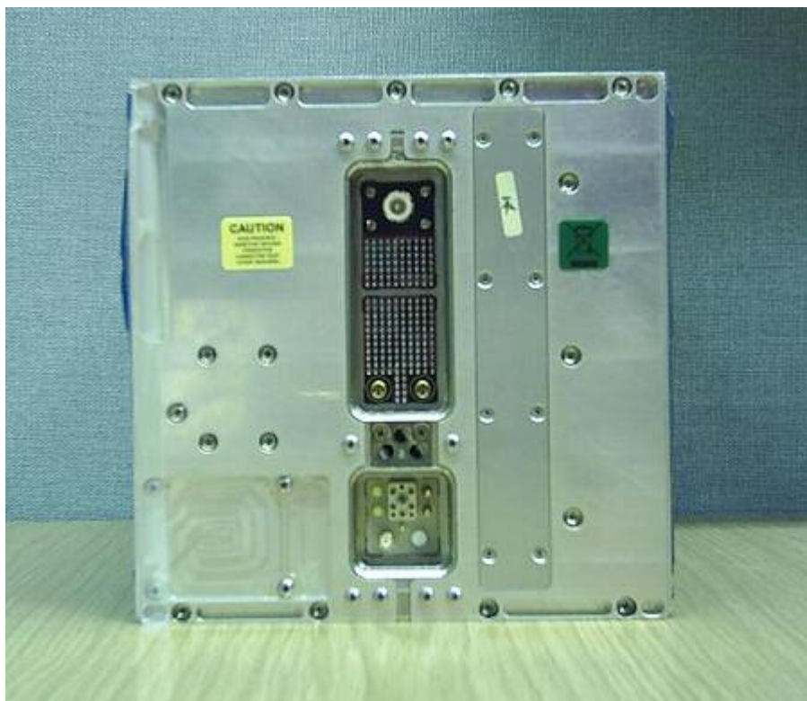
Figure 5: SDU Rear