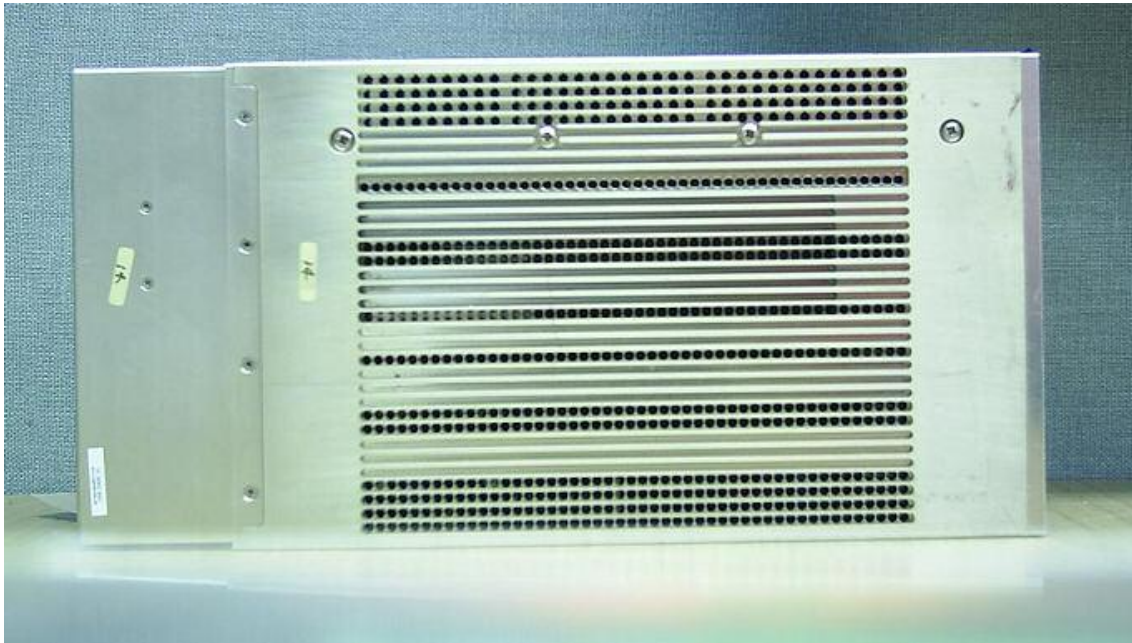
Figure 1: SDU Top