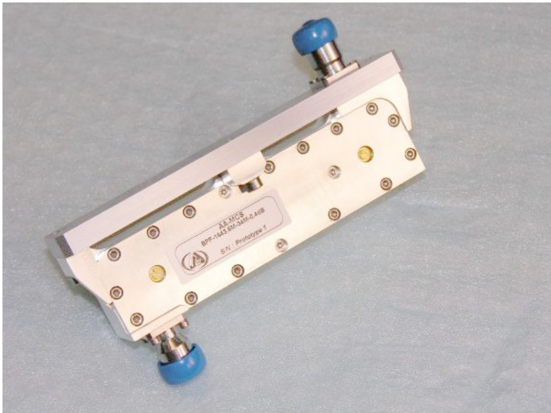
Figure 4: Filter bottom