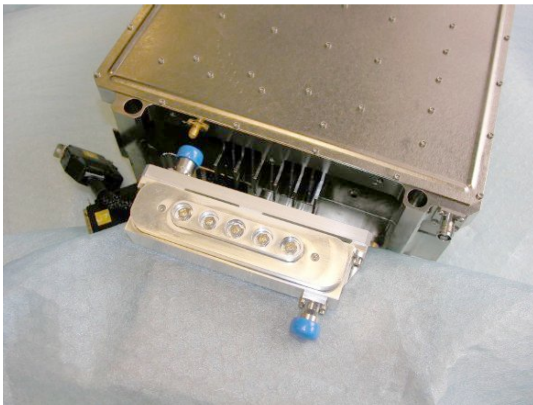
Figure 2: FMHPA with filter fitted, back/top