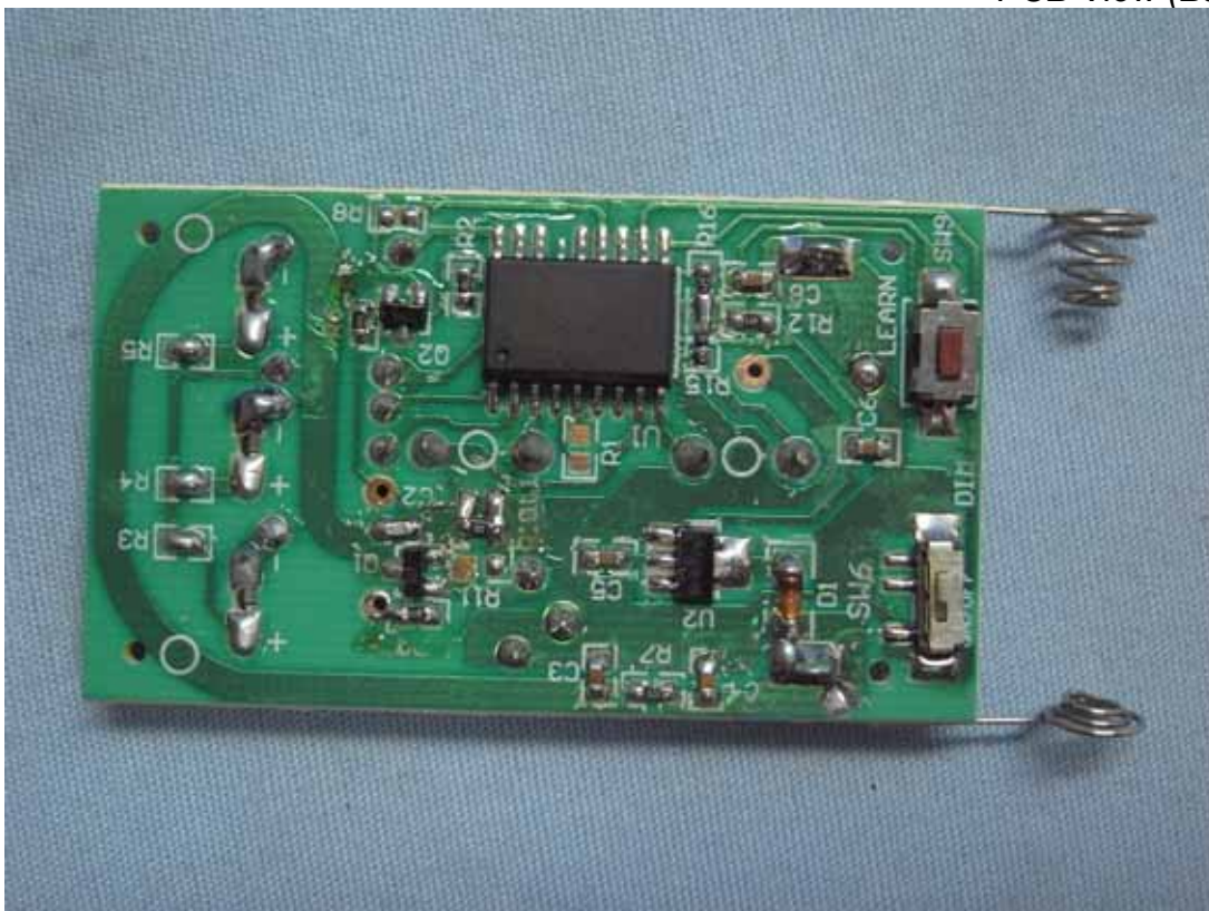
Photo 6 Battery