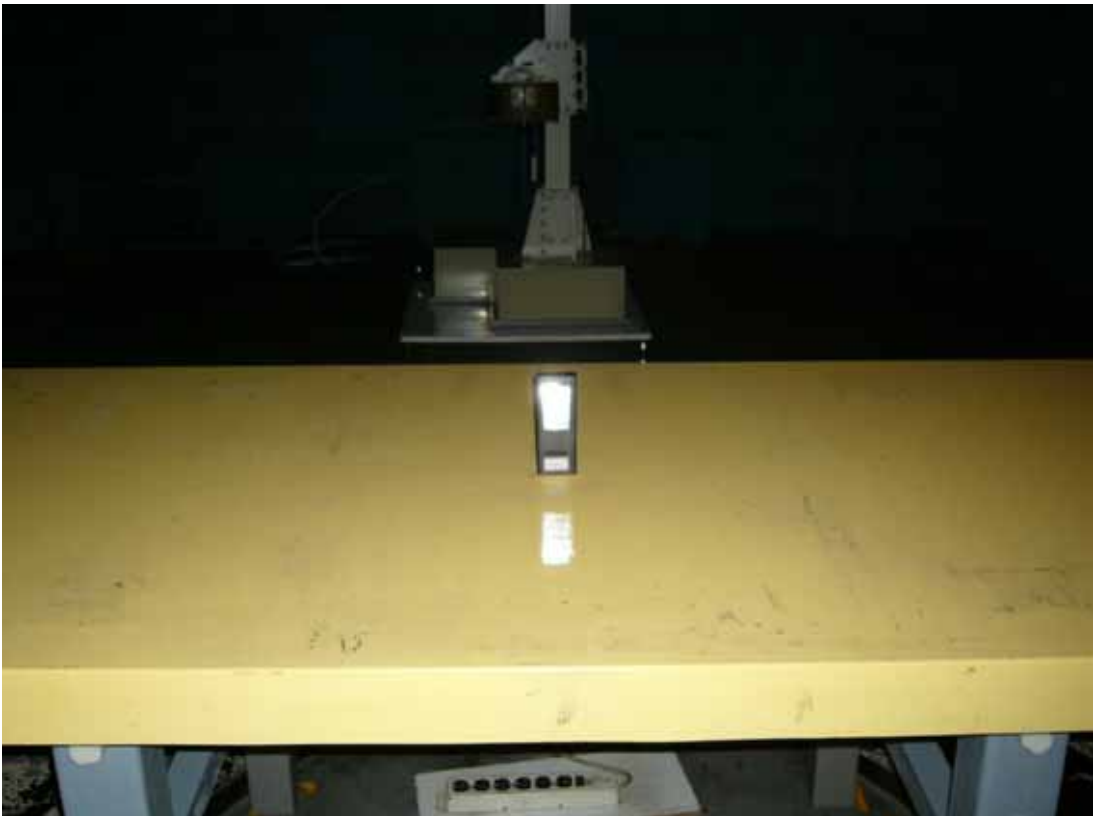
EUT on Stand