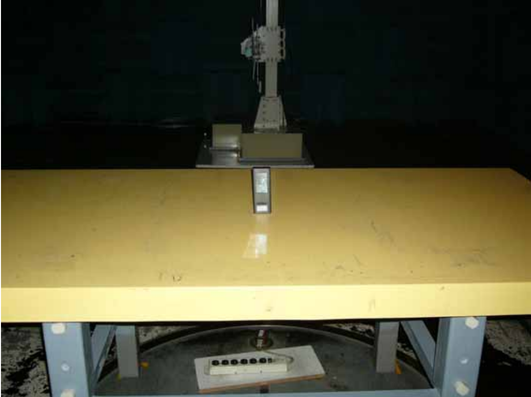
EUT on Side